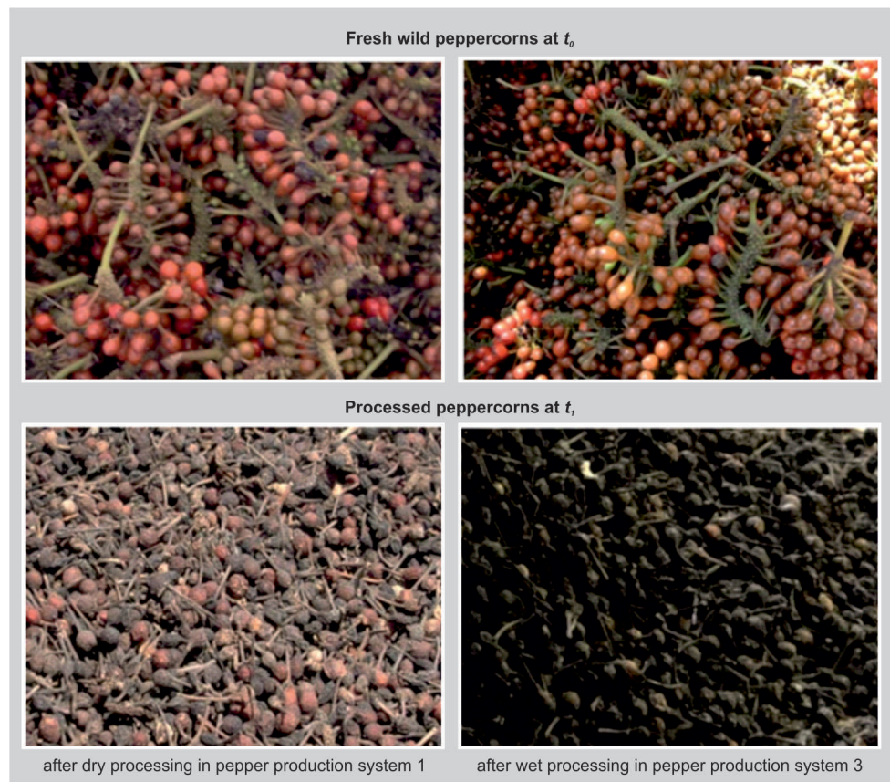
Figure 3. Fresh wild peppercorns at t_0 , and processed peppercorns at t_1 either after dry processing in pepper production system 1 or after wet processing in pepper production system 3 (Madagascar). A color figure is available at www.fruits-journal.org .

village markets or collecting points. Pepper spikes were kept in plastic bags that were sometimes hung above ground to protect them from animals. At night, the pepper was sometimes spread on the plastic bags or on banana leaves.