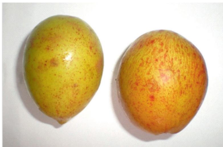
Figure 1. Mangaba fruits ( Hancornia speciosa Gomes).

The diameter of the mangaba ranged from 2.4 cm to 6.2 cm, and its length ranged from 2.3 cm to 6.7 cm. The mangaba mass from the Minas Gerais (on average, 53.9 g, from 12.3 g to 142.3 g) was 50% higher than those grown in the state of Paraíba, Brazil [20]. However, the pulp yield (on average, 85.1%, from 74.6% to 86.9%) was similar to fruits from the other Brazilian states (84.9% and 87.0%) [20, 21]. The fruit mass and pulp