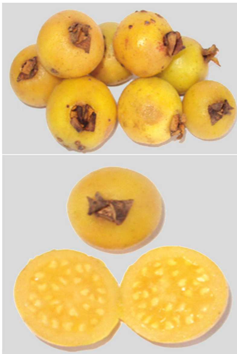
Figure 1. Fruits of the 'araçá of Cerrado' ( Psidium firmum O. Berg). fruits such as guava and other varieties of araçá may reflect the intrinsic characteristics of each fruit, which are of different species.

Cerrado fruits are not domesticated and therefore their chemical content and physical characteristics may vary significantly. These characteristics may be affected by the edaphoclimatic characteristics of the fruit collection sites. Furthermore, differences between the physical characteristics observed in the 'araçá of Cerrado' and in other