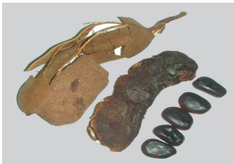
Figure 1. Photographic representation of tamarind fruits ( Tamarindus indica L.).

Data related to macronutrient contents of the tamarind pulp grown in the Cerrado of