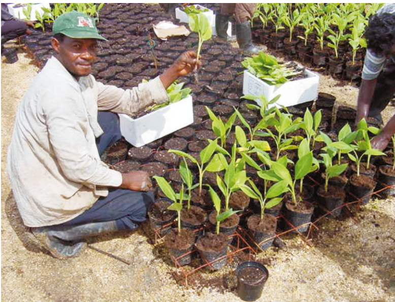
Figure 4. Removal of weaned plants from polystyrene boxes and transplanting into nursery polypots. Note plug must be placed 2 cm below surface of medium.

If the nursery medium is not composted (organic) or sterilised (sand/soil), and the nursery cannot be irrigated with chlorinated water, then drench the filled bags with an approved fungicide as a precaution against soil diseases (e.g., propamocarb hydrochloride or mancozeb/metalaxyl-m at the recommended concentration). Use either thin-gauge disposable black plastic bags (figures 3, 4) or thick re-usable polypropylene pots ('polypots') for growing out the young plants on raised beds (figure 5). Common sizes for nursery bags or pots are 1.5–2.5 L (average 2 L [3]), although much smaller pots are used in Taiwan [4]. Bags or pots must contain adequate drainage holes. Note: the advantages of a larger 2.5-L bag are that spacing of plants can be wider in the nursery, plants can be left for longer in the bag, thus allowing them to harden more, and off-types can be more easily detected on larger nursery plants. However, these plants have to be sold at a higher price due to increased bag, medium, fertiliser and transport costs, and fewer plants fitting into the available nursery space.