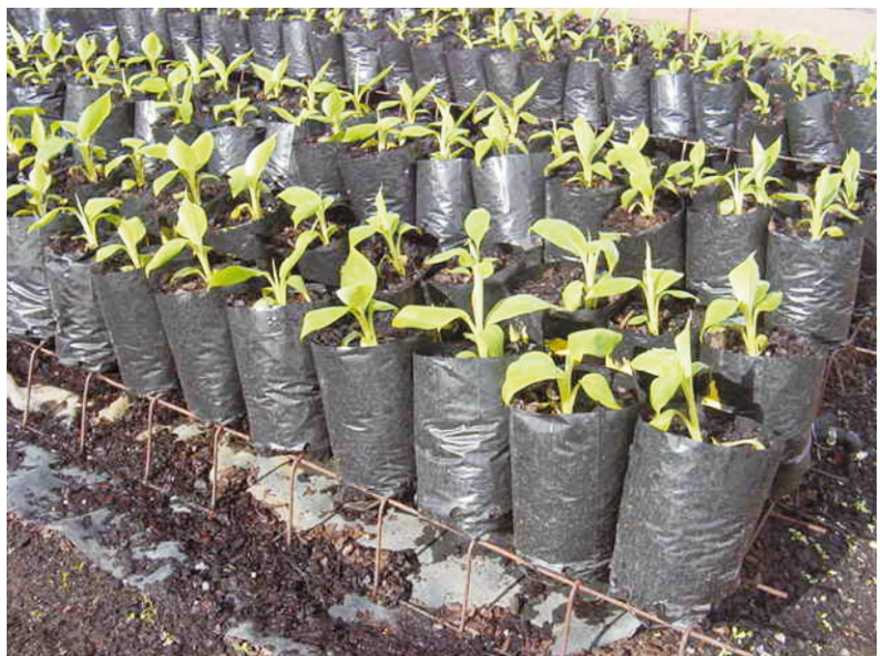
Figure 3. Weaned banana plants newly transplanted into the nursery. Note (a) plants raised above soil level on a metal frame, which in turn rests on a polyethylene ground cover, (b) the use of 1.5-L disposable polyethylene bags, (c) uniformly spaced plants in double rows for mutual support, and at a density of 24 plants·m -2 .