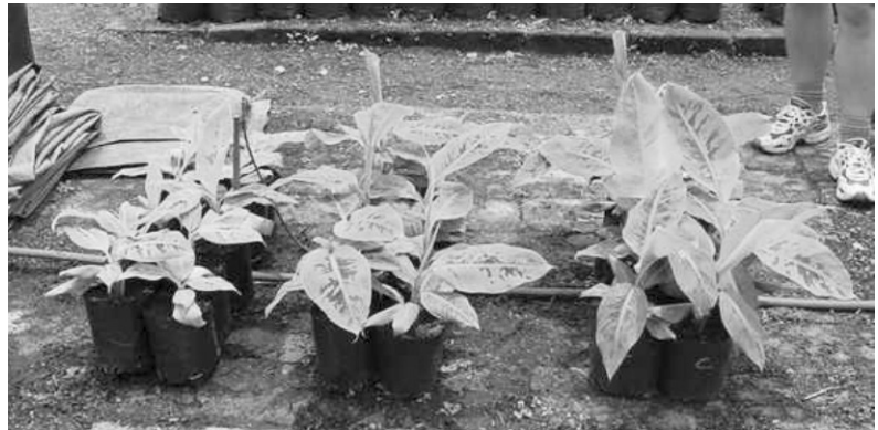
Figure 9. Fertiliser trial showing nursery plants with low nitrogen (left), medium nitrogen (middle) and high nitrogen (right). Sufficient nitrogen is critical for banana nursery growth.

– All leaves along the pseudostem have a dark green, healthy and normal appearance, and have the normal proportion of anthocyanin