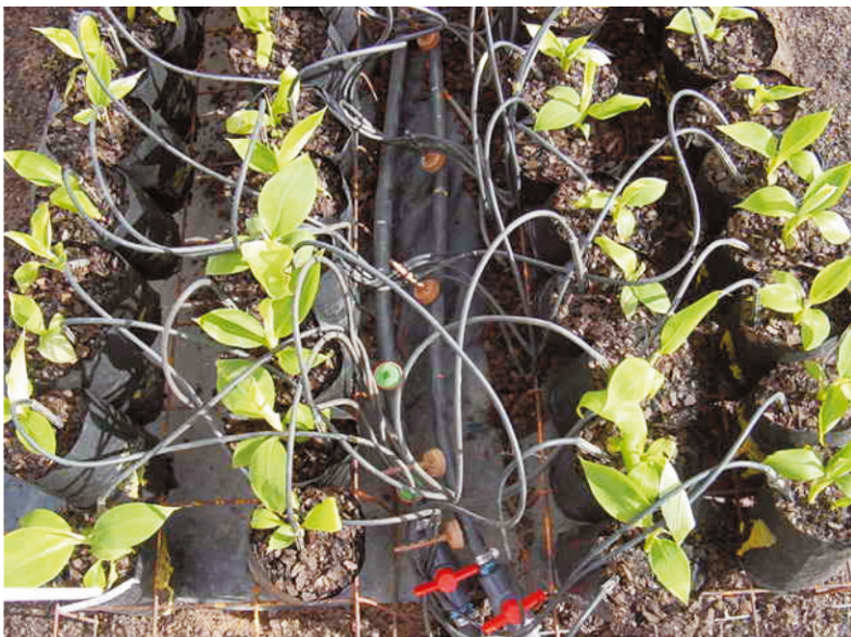
Figure 6. Uniform and accurate irrigation of nursery plants using a "spaghetti" drip system (one dripper to each bag).

Note: Do not, under any circumstances, establish nursery plants at random with variable spacings, because this encourages uneven competition and variable growth.