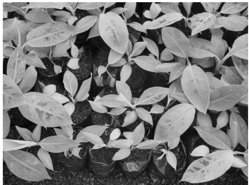
Figure 10. Variable growth rate of banana plants in the nursery due to (a) overcrowding at high density and/or (b) poor size-grading at planting.

pigmentation in the lamina. Leaves are not pale green, misshapen or wilted at delivery. In particular, leaves are not yellow or senescent in any way.