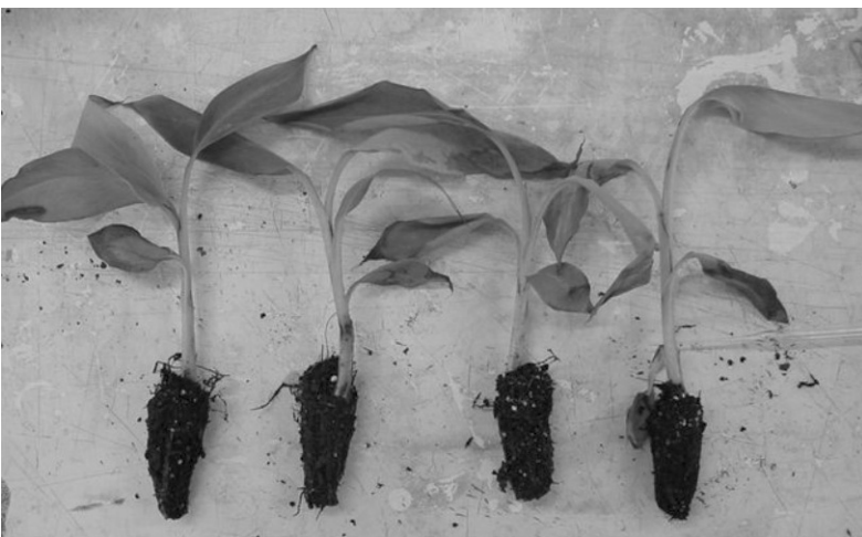
Figure 8. Young transplants in the nursery with leaves which have wilted, folded and turned yellow/brown, and with an absence of new roots. This can result from over-irrigation and waterlogging.

Solution: use composted or sterilised medium; use chlorinated water; drench bags with fungicide as described under nursery media.