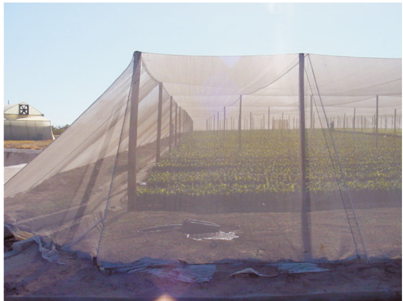
Figure 2. Typical shade net nursery structure with wooden poles braced with crosswires, slanting sides, net sewn onto wires and cement drain along sides.

Prevention of nematode infestation is critical at nursery level if a clean start in the field is to be achieved. Organic composted media would normally be free of pathogenic nematodes, but where soil or river sand is used, there is a risk factor for nematodes. In such a case granular nematicide may be added to the bags as a precaution. The irrigation water should be sourced from a clean borehole or be chemically treated (chlorination) or filtered against nematodes.