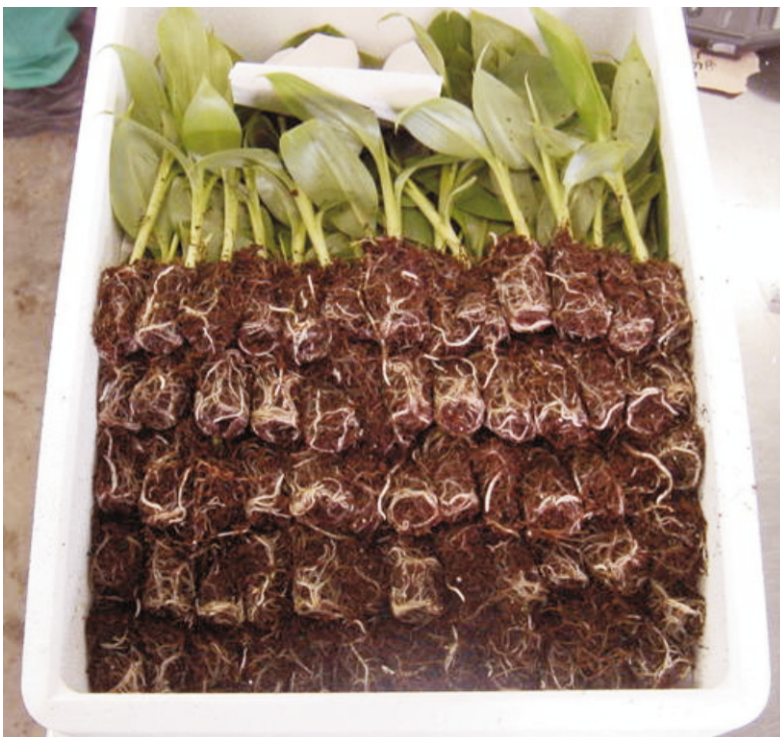
Figure 1. Weaned plants extracted from trays and placed neatly in a polystyrene box for transfer to the nursery.

level and the growth stage at which the plants are required for the field.