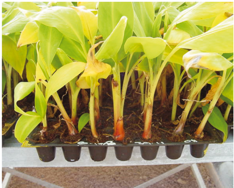
Figure 9. Banana plants left too long in weaning, resulting in overmature, senescent symptoms and root-bound plugs.

Solution: produce shorter and thicker plants for transplanting; handle with care at transplanting.