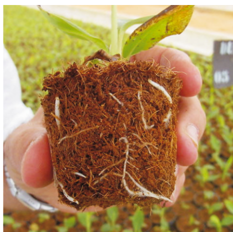
Figure 4. Coconut coir weaning medium showing good air-filled porosity and excellent banana rooting potential, but causing salinity damage on lower leaf.

Note: inoculation with arbuscular mycorrhizae may be beneficial for the plant by increasing its growth rate, facilitating nutrient uptake and increasing disease tolerance [2].