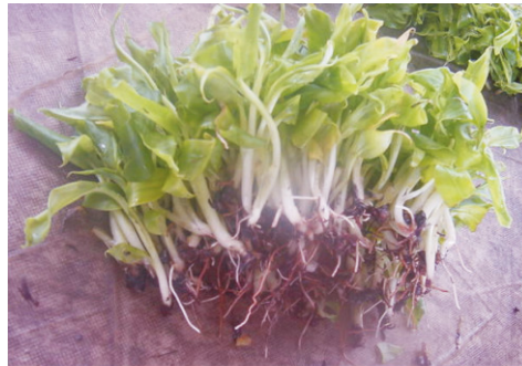
Figure 1. Tender new banana vitroplants, just removed from the laboratory flask.