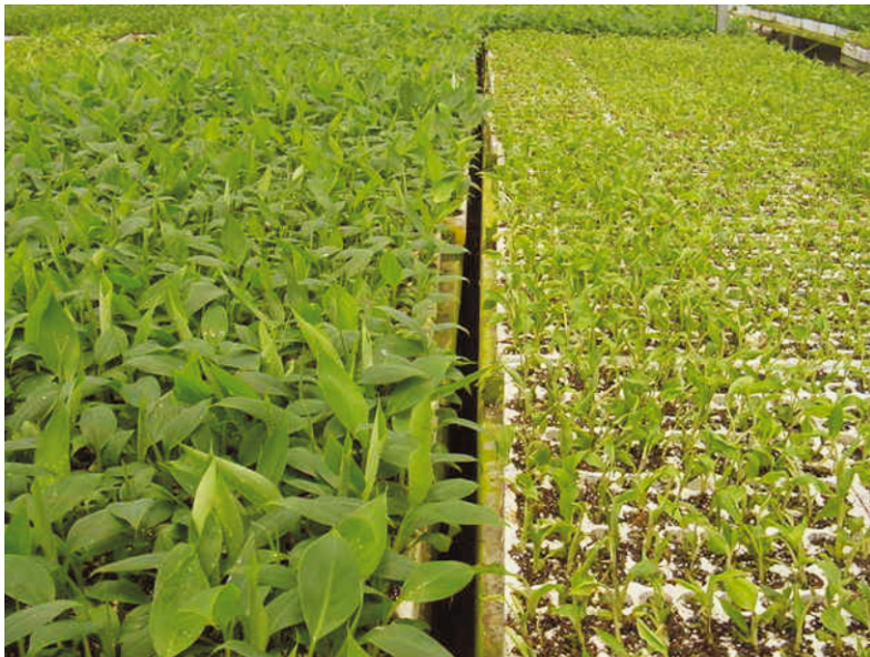
Figure 2. Newly-transplanted banana vitroplants (right) and nearing completion of the weaning period (left).