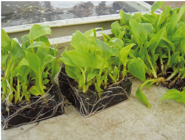
Figure 6. Rooted banana plants in agar gel, just removed from a laboratory flask (left), separated from the gel (right) with the dipping and cleaning tank (background).

The usual weaning tray is made of 32 density molded polystyrene and contains round or square tapered holes or plugs (30 mm diameter \times 60 mm deep) which have a drainage hole at the bottom. Variations in plug size and shape are used according to preference.