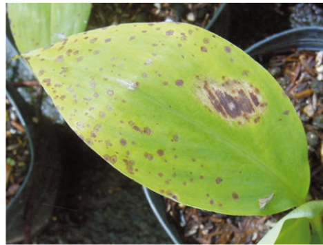
Figure 8. Mature weaned banana plant showing Cercospora leaf spotting from overcrowded, humid conditions in the weaning house.

(k) Brittle white stems of new transplants break or become damaged. Causes could be that (a) plants were too long and lanky at removal from the flask; (b) there was rough handling at planting into the weaning medium.