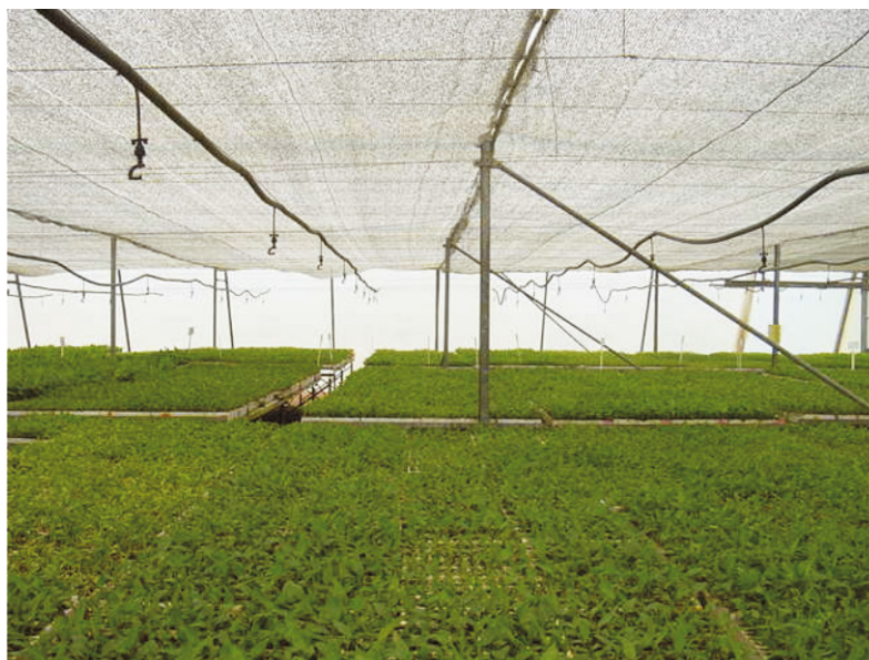
Figure 3. Inside a plastic weaning house, showing trays with transplanted banana vitroplants on moveable tables, shade cloth protection, and overhead misting system.

Fertilize plants during weaning by one of two options: (A) Pre-mix the weaning medium with a slow-release fertilizer (SRF) containing a NPK ratio of [2:1:2]. An acceptable mix would be 3–5 kg SRF·m -3 of medium (3–5 g·L -1 ), depending on the