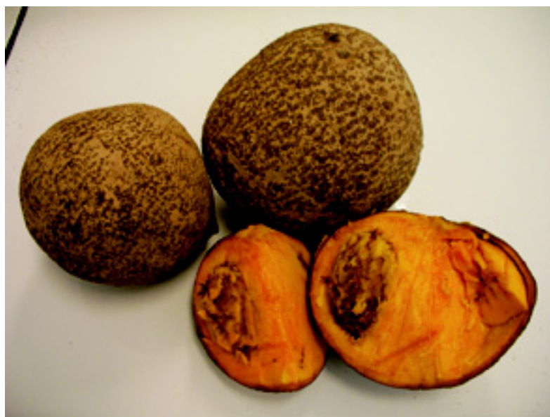
Figure 3. Whole fruits and cut fruit of the Pavé 11 variety (mamey, Mammea americana L.) selected on Martinique Island (France).

Certain tendencies appeared: thus, the seed adherence to pulp did not vary between the fruits of the same tree, whatever the land;