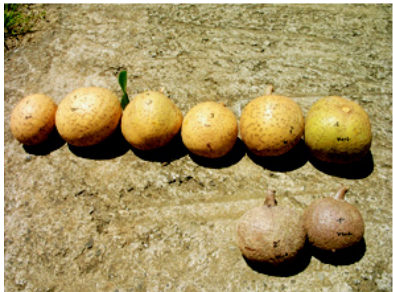
Figure 6. Ripe fruits of the Ti Jacques variety (mamey, Mammea americana L.) selected on Martinique Island (France): fruits 1 to 6 with attractive color and smooth epicarp more appreciated for fresh fruit consumption than fruits 1 and 2, brown, with rough epicarp.