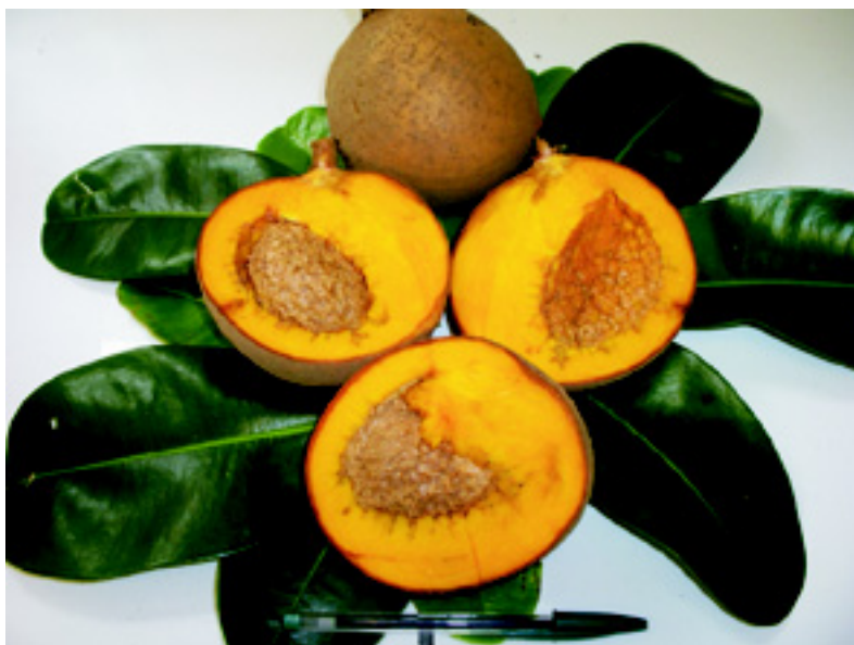
Figure 2. Whole fruit and cut fruit of the Ti Jacques variety (mamey, Mammea americana L.) selected on Martinique Island (France).