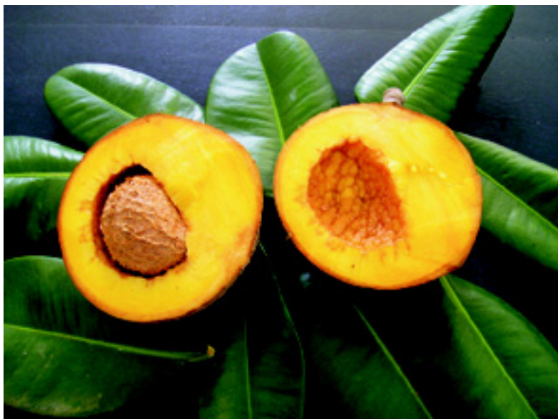
Figure 1. Open fruit of the Sonson variety (mamey, Mammea americana L.) selected on Martinique Island (France).