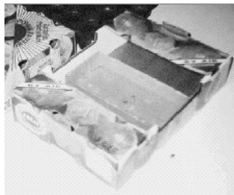
Figure 1. The carton box manufactured by the Rigesa® Company utilized for exportation and commercialization of figs in São Paulo State, Brazil.

To precool the figs, the air flow was 2.8 \text{ L} \cdot \text{s}^{-1} per kg of product, with an average air velocity of 2.0 \text{ m} \cdot \text{s}^{-1} . The airflow reversed during precooling to avoid freezing. The temperature of the air used for precooling was -1 \text{ }^\circ\text{C} . The initial temperature of the fruits was 20 \text{ }^\circ\text{C} and the final temperature was 1 \text{ }^\circ\text{C} , which is a suitable temperature for fig storage. To calculate the effective air flow into the packing, the effective opening area and the air velocity over the fruits were taken into consideration. Eight points of the internal temperature of the fruits on each side of the Californian tunnel were monitored. The thermocouples (type T AWG # 24) were located on a crossed diagonal line on each side of the Californian tunnel. Forty-eight packages (total 96 kg of product) were