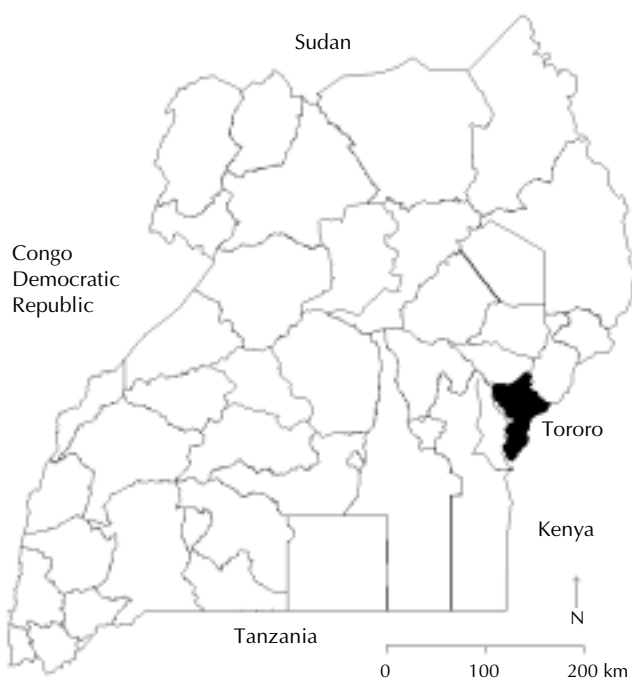
Figure 1: Map of Uganda showing Tororo district where the study area was located.

interspersed with Lantana camara shrubs. The district receives 1200-1500 mm rainfall annually. The rainfall is bimodal with two wet seasons (March-May and September-November) and two dry seasons (December-February and June-August). The area has a mean relative humidity of 65% and daily mean temperatures range between 15°C minimum and 27°C maximum.