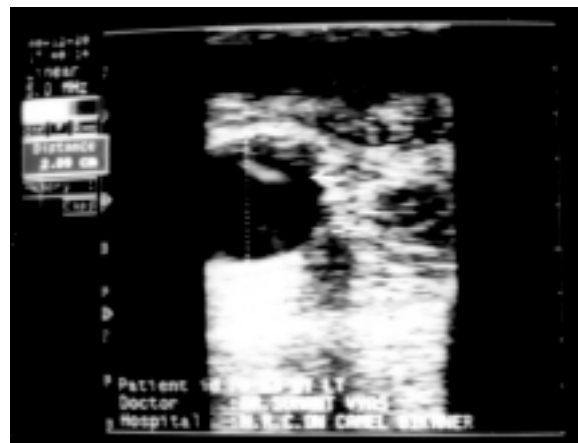
Figure 3: Ultrasonogram of uterus showing large embryonic vesicle (2.89 cm, day 23 postmating), embryo proper visible; transducer was placed on ventro-lateral aspect of left horn.