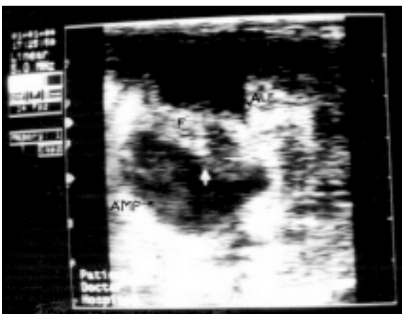
Figure 5: Ultrasonogram of day 40 postmating showing amniotic fluid (AMF, slightly echogenic), allantoic fluid (ALF, anechoic) and cardiac region (anechoic spot in echogenic fetus, F).