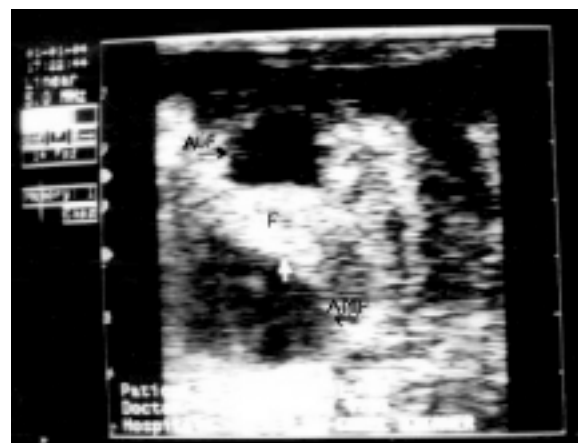
Figure 8: Ultrasonogram of day 40 postmating showing fetus (F), amniotic fluid (AMF, slightly echogenic) and allantoic fluid (ALF, clear anechoic).