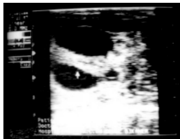
Figure 9: Ultrasonogram of day 40 postmating showing echogenic fetus.