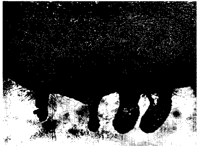
Figure 3: Lesions by Tunga penetrans in the teats of a sow.

At present, tungiasis is a serious public health problem in São Tomé involving both swine and man. The parasite seems to be frequent especially in children, as the fact was mentioned by some school teachers. The pig farming methods which allow the animals to move freely among the houses in search of waste, as well as the very limited use of shoes by the inhabitants, especially children, result in a large diffusion of the disease due to a wide dissemination of eggs over the ground. It may be assumed that,