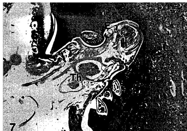
Figure 7: A detail of the head and thorax of Tunga penetrans (PAS, x 125). E = eye, H = head, L = legs, Th = thorax.

in the past, the condition was probably imported into the island by infected persons, but pigs are certainly now a reservoir of the disease. In fact, while the natives can rely on self-treatment by immediately removing the parasite using a thorn or a needle, thus interrupting the parasite's life cycle, swine passively undergo the establishment of hundreds of insects in their skin without defense, and spread thousands of eggs over the ground with their movements among the houses.