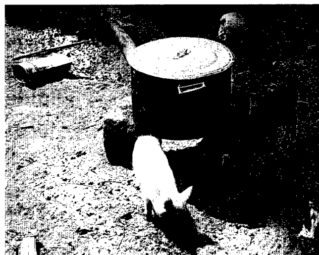
Figure 1: Pigs kept free to circulate among the houses in São Tomé.

The pigs examined (100 head consisting of 66 males and 34 females aged 6 to 18 months) all came from small herds of the family type sited in the districts of Agua Grande, Lobata, Mesoxi and Lemba. They were all crossbred and had been taken to the public abattoir for slaughter from January to March 1992. These were all the pigs slaughtered during this period under veterinary control.