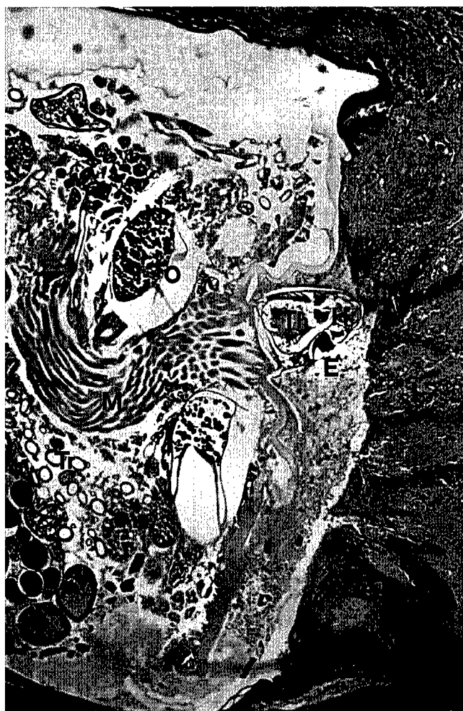
Figure 6: Histological section of Tunga penetrans (Trichromic Masson Goldner, x 62). E = eye, H = head, M = muscle fibers, O = ovary, Th = thorax, Tr = tracheae.

in the past, the condition was probably imported into the island by infected persons, but pigs are certainly now a reservoir of the disease. In fact, while the natives can rely on self-treatment by immediately removing the parasite using a thorn or a needle, thus interrupting the parasite's life cycle, swine passively undergo the establishment of hundreds of insects in their skin without defense, and spread thousands of eggs over the ground with their movements among the houses.