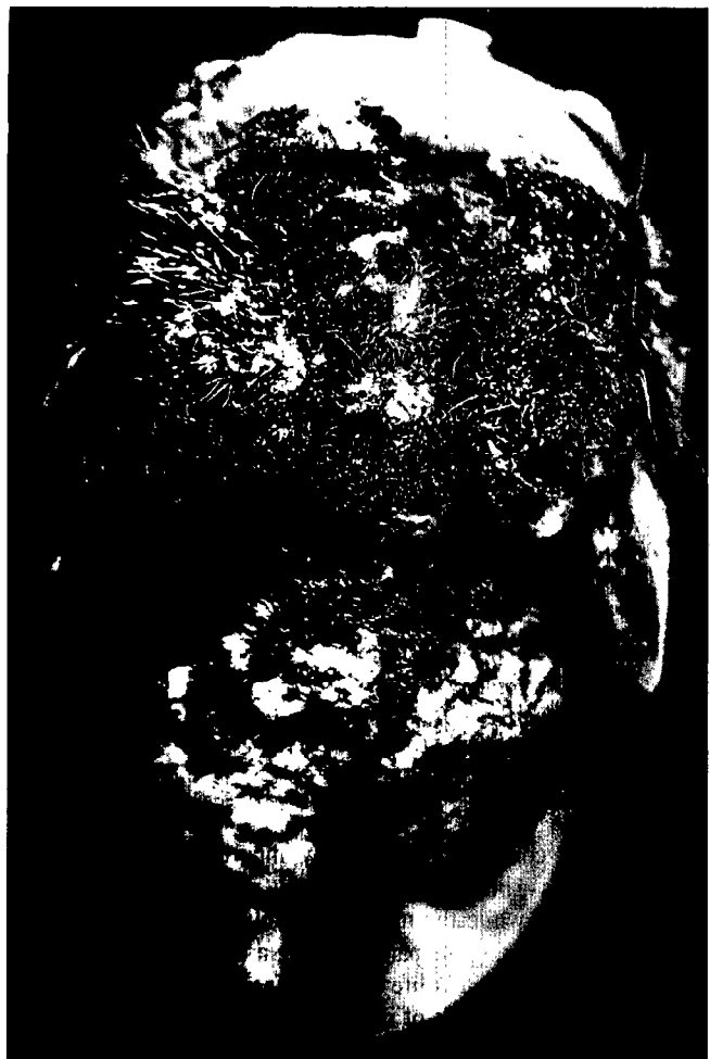
Figure 4: A foot of swine seriously affected by Tunga penetrans .