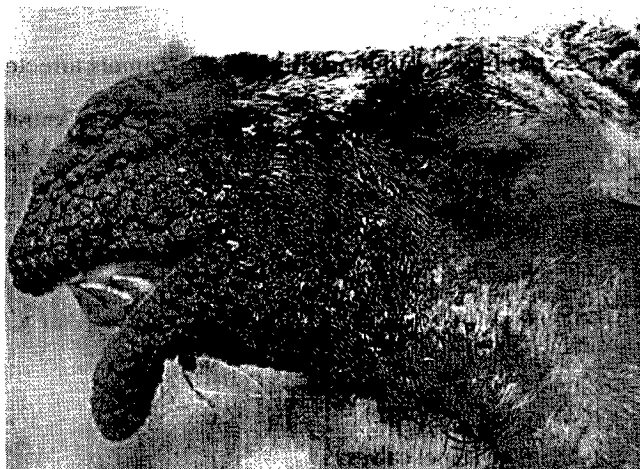
Figure 4: camel contagious ecthyma: a close-up view of the affected camel face showing scabby lesions around the lips, nostrils and eyes. Note the lower lip is pendulous.

The CCE outbreaks reported in the present study occurred in several camel herds belonging to different tribes and involving different breeds of camels. The observed clinical symptoms of the disease compared well with those described previously (3, 5, 8, 11). The total morbidity rate was found to be 10% while the mean morbidity and mortality rates in the susceptible age group (camel calves less than one year old) were 60.2% and 8.8%, respectively.