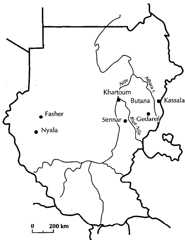
Figure 1: map of the Sudan showing the area of study.

season (November-June), some of them move southward up to Doka area, 350 km South of Kassala, few migrate northward up to Gash Delta and others cross over to the Red Sea coast around Sawakin and Toker (400 km North East of Kassala) to take advantage of range developing as a result of the winter rains (1). The Shukriya, Lahawiyin, Bawadra and Mussalamiya stay in Butana in the rainy season and move during the dry season towards the Atbara River basin. A significant proportion of these tribes as well as some of Rashaida coordinate their movements to coincide with the harvest season (January-March) thus using the crop residues in the rain-fed agricultural schemes of Gedaref area (1). Ruffaa, Kawahla and Arakiyin tribes of the Blue Nile area spend the dry season at rain-fed agricultural schemes in the area and move to the North towards Butana plains in the rainy season to use free range pasture.