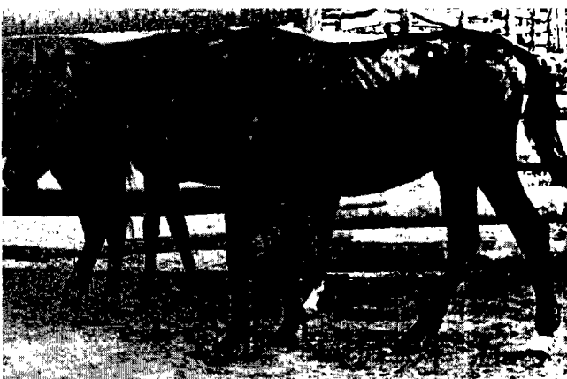
Figure 2: Horse presenting signs of Mal de Caderas due to Trypanosoma evansi . The signs include edema of the legs and lower parts of the body and loss of condition.

Between March and June no case was reported by the ranchers. However, in July 12 horse deaths occurred in three other ranches (R6, R7 and R8) located close to R4