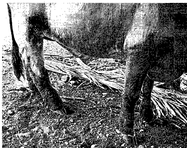
Photo 7 : The case shown in photo 3 at 3 weeks post-treatment. Note peeled-off lesions of the treated lower extremities which have underlying erythematous tissue.

A reapplication of Lamstreptocide A & B to the previously treated body areas of 3 of the 5 positive post-treatment cases did not yield any remarkable change of lesions 2 weeks later. The result of the in vitro sensitivity test for the antibacterial activity of Lamstreptocide A & B is shown in table III. A slowing down of growth of D. congolensis was observed at concentrations of Lamstreptocide A & B