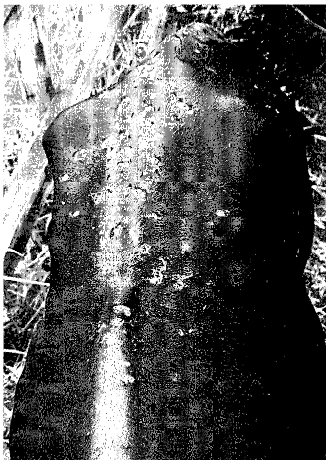
Photo 6 : The dried lesions of the animal shown in photo 2 , at 3 weeks post-treatment.

erythematous underlying tissue (photo 7), there was no remarkable change of lesions between the treated and untreated body areas.