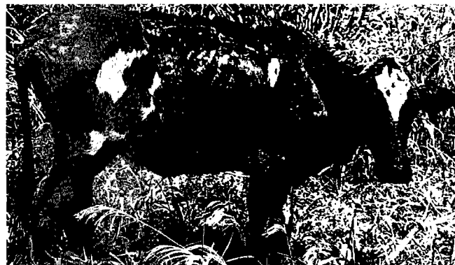
Photo 4 : A pre-treatment calf with severe, generalized confluent and exudative lesions. Note the overall poor body condition.

ne cases, MO1 and CN2, had scabby lesions on the face, pinnae and other areas of head and neck. The overall body condition of the typical caprine case was fair (photo 5).