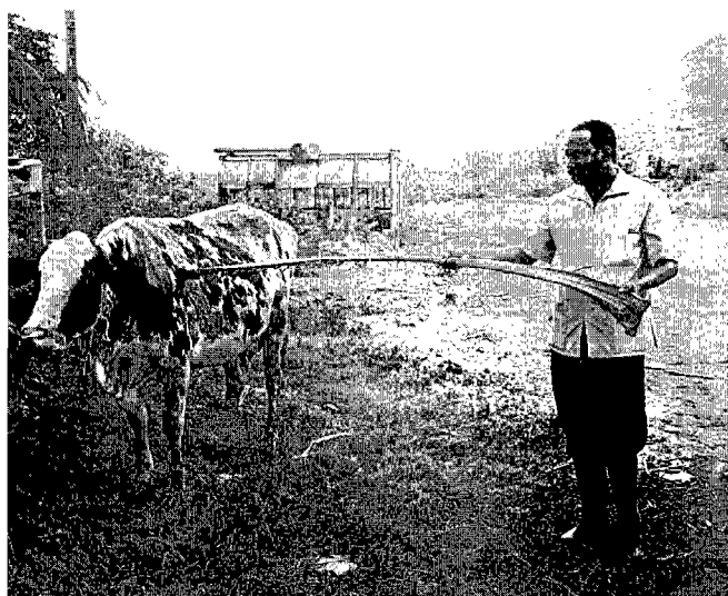
Photo 1 : Topical application of Lamstreptocide A & B by means of a brush tied to a stick.