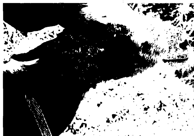
Photo 5 : A pre-treatment caprine case showing lesions on the face, pinnae and other areas of the head and neck.