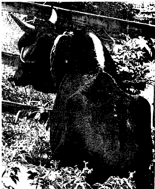
Photo 2 : A pre-treatment case with discrete, isolated scabs on the dorsum of the trunk.