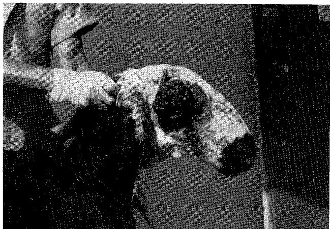
Photo 3 : Advanced stage of ocular SCC replacing the eye and periocular tissue.