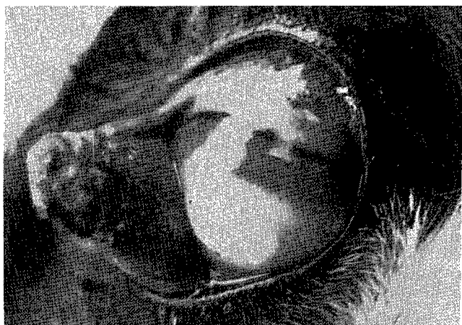
Photo 2 : Early ocular SCC involving the nictitating membrane. Note purulent conjunctivitis and corneal opacity.