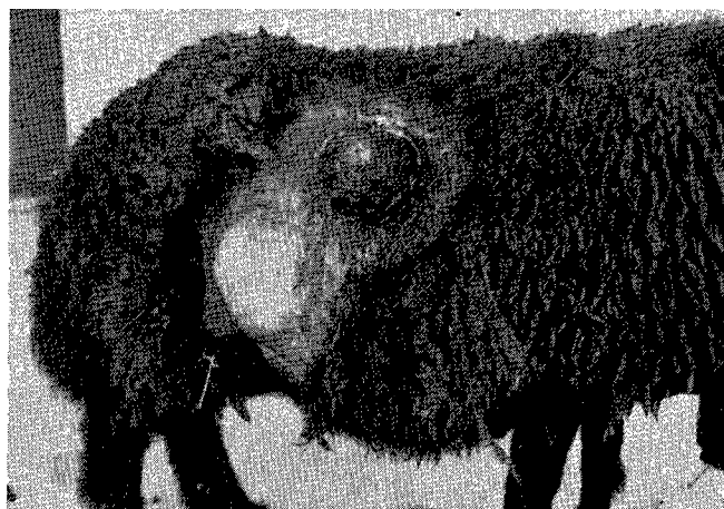
Photo 5 : SCC at the flank region. Note enlarged precrural (pre-femoral lymph node) arrow.