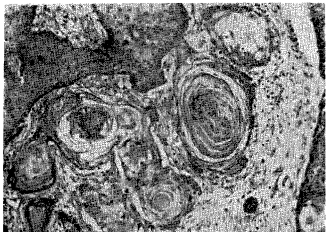
Photo 6 : SCC showing islands of epithelial cells enclosing keratin pearls (H & E x 200).