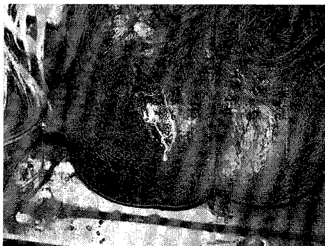
Photo 2 : A wound in a goat involving udder tissue as indicated by leakage of milk.