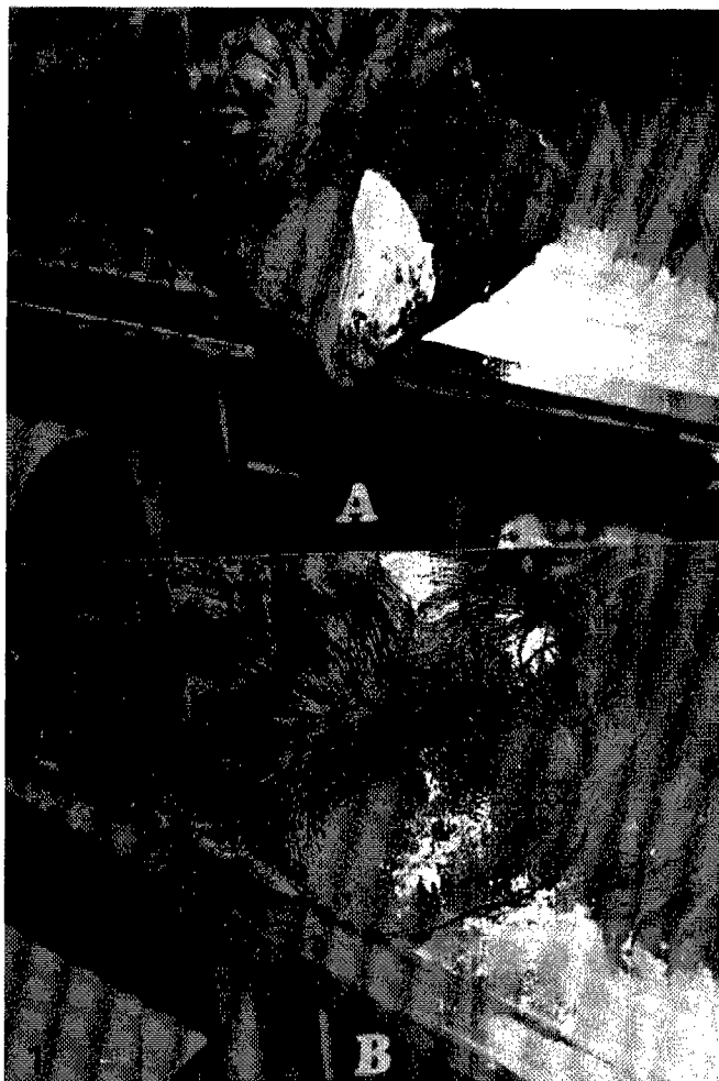
Photo 1 : A) Skin wound in the teat and udder of an ewe ; B) the same wound following use of tissue adhesive.