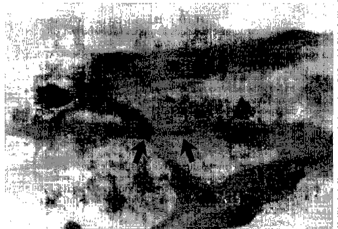
Photo 1 : Brain crush smear showing rickettsial bodies in the capillary endothelial cells (arrows).

Faecal examination was found positive for nematode ova. Smears of blood, lymphnode and spleen stained with Giemsa did not reveal any haemoparasite. Internal organs and thoracic fluid collected, taking sterile precautions, and subjected to bacteriological culturing, yielded no significant bacteria. Ticks were identified as Amblyomma variegatum . Brain crush smears fixed in methanol and stained with Giemsa revealed numerous groups of characteristic colonies resembling Cowdria ruminantium which appeared as reddish purple to blue in endothelial cells of the brain capillaries (photo 1).