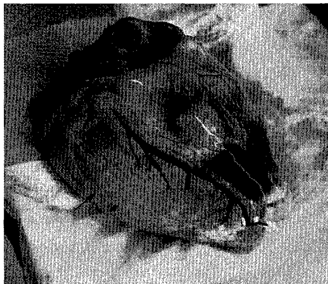
Photo 1 : Severe heart muscle necrosis in a four-week old camel calf suffering from C. perfringens A enterotoxemia .

* The authors are indebted to Dr ADNAN AL ASHBALD, Dubai Hospital, for carrying out the histopathology.