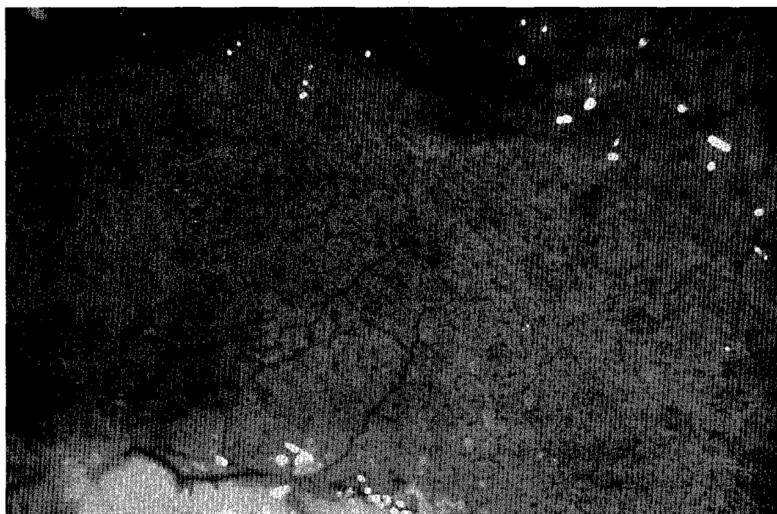
Photo 2 : C. perfringens A enterotoxemia in a four-week old camel calf; petechial haemorrhages under the lung pleura.