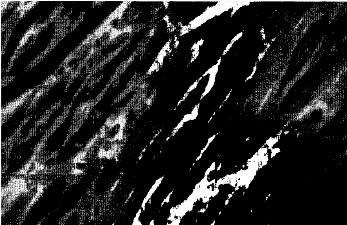
Photo 4 : Cardiac muscle necrosis with lysis of nuclei and granular Z-band material in a four week old camel calf.

C. perfringens , type A was isolated from the abomasum, small intestine duodenum, mesenteric lymph nodes, liver and kidney but not from the heart and prescapular lymph nodes. C. perfringens rods were also observed in large numbers in direct smears of the intestinal tract with Gram stain. E. coli was isolated from the intestinal tract but no Salmonellae were cultivated.