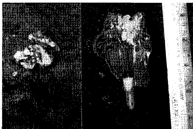
Fig. 2 : Air sac of broiler chicks showing septate Aspergillus fumigatus hyphae. (H & E, x 400).

Microscopic pathological changes were similar in the 3 groups of chickens studied. The H & E sections of the lungs and air sacs showed severe granulomatous inflammation. The granulomas contained eosinophilic debris, epithelioid cells, giant cells and poorly stained eosinophilic fungal hyphae or remnants of dead hyphae. Areas of fresh infection were characterized by necrosis and massive phagocytic activity. Granulomas on the serous wall of the intestines were associated with necrosis of the villus epithelial cells. Sections of the lungs, thoracic and abdominal air sacs and intestines stained with PAS or Grocott showed well stained septate, dichotomously branching fungal hyphae (Fig. 2).