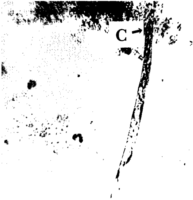
Fig. 1a : Anterior end of Dipetalonema reconditum . x 500. C : cephalic hook.