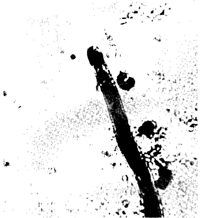
Fig. 2a : Anterior end of Dirofilaria repens . x 1250. Note the absence of cephalic hook.