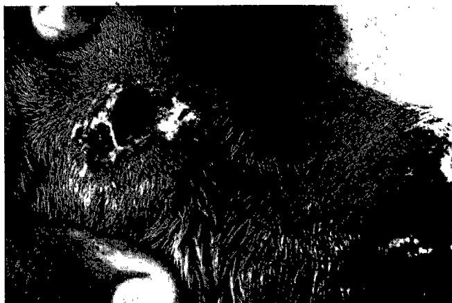
Photo 1 : Clinical, pathological and epidemiological characterisation of PPR in Sokoto Red goats.

Gross and histopathological findings were consistent with those described for in other breeds (12, 16, 19).