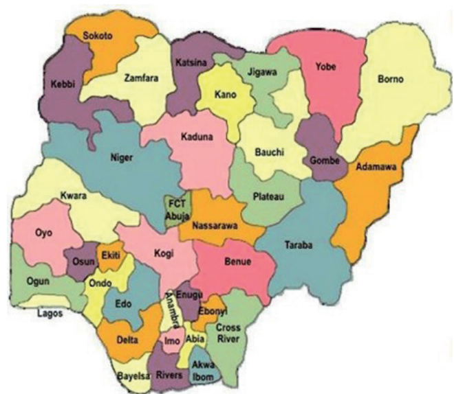
Figure 2: States of Nigeria; http://dailymail.com.ng/wp-content/uploads/2015/01/10360606_10203337420937904_71905998820449261_n.jpg ; accessed 16 July 2017.

Brucellosis is a contagious bacterial disease affecting pigs caused by Brucella abortus , B. melitensis and B. suis . The disease is associated with reproductive disorders which lead to male and female infertility and abortions. Sows in Edo State were reported to have abortions and 39% of the 55 samples collected from 25 farms yielded isolates of Brucella suis predominantly, as well as of B. melitensis and B.