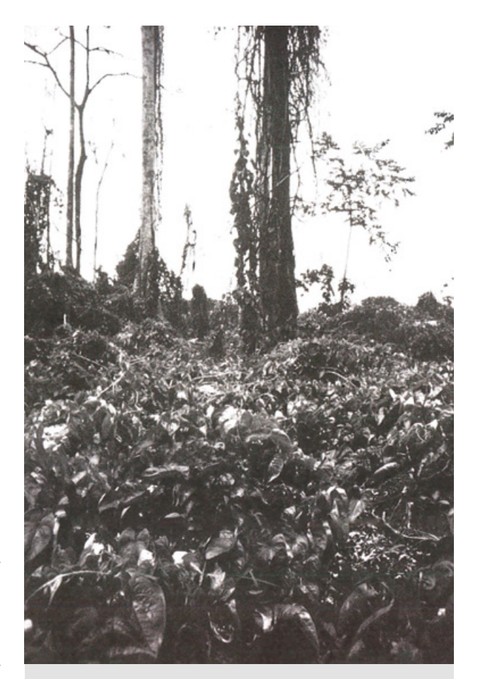
Photo 4. Installation of farming in a logged forest area.