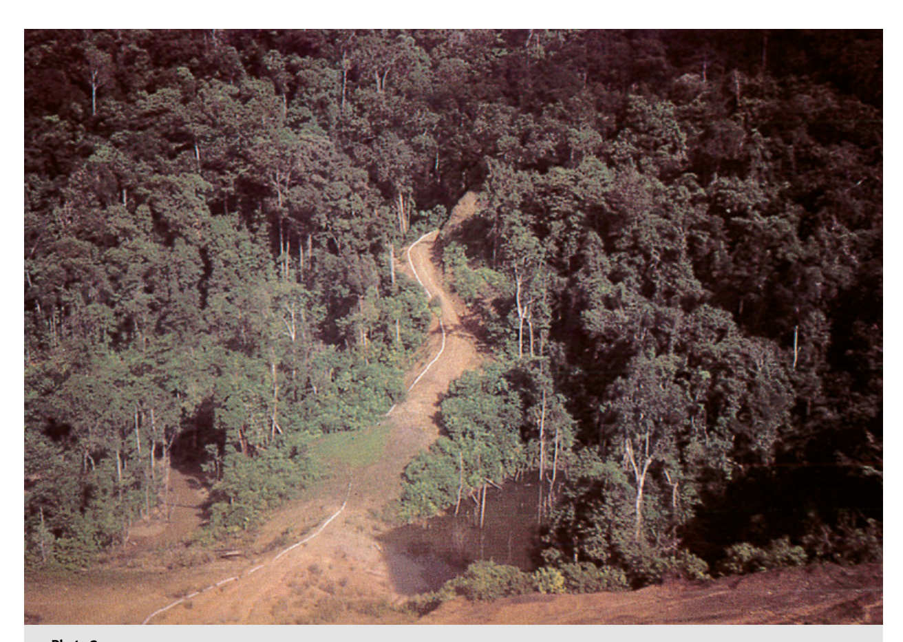
Photo 3. Construction of a terrace near a forest base camp. Photo J. Estève, 1983.