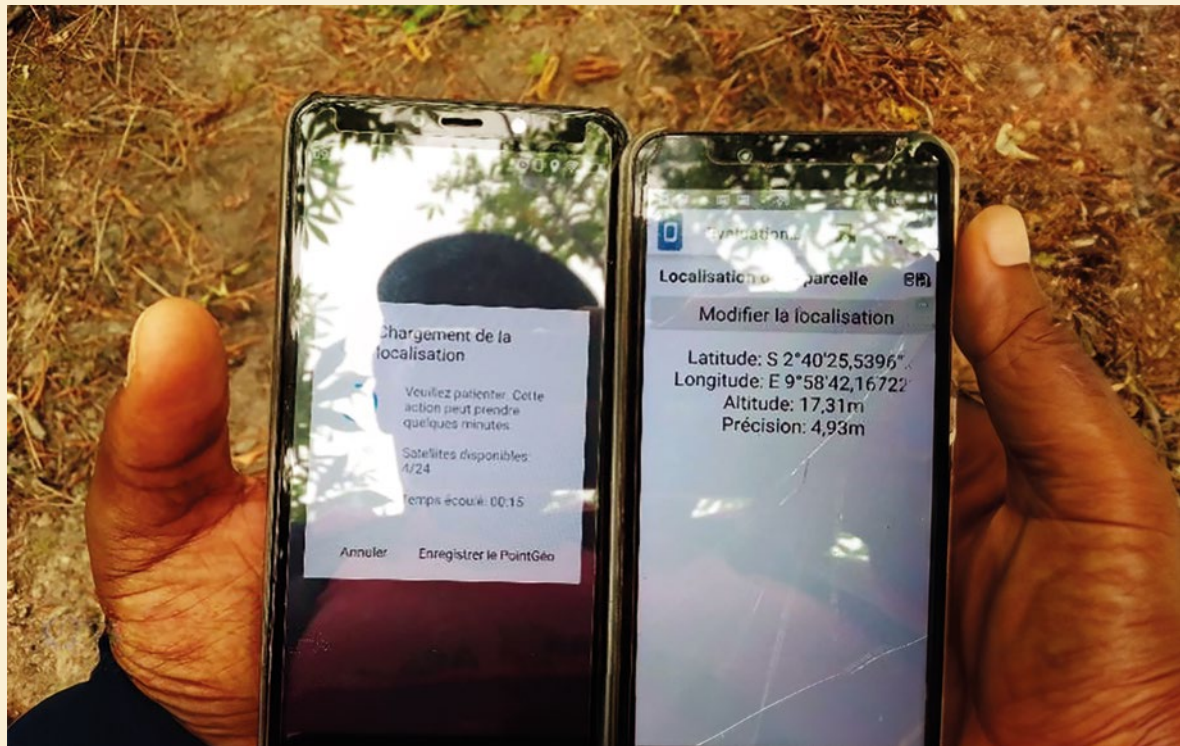
Photo 1. Collecting location data with the KoboCollect application and a smartphone.

Doi : 10.19182/bft2024.359.a37445 – Droit d'auteur © 2024, Bois et Forêts des Tropiques – © Cirad – Date de soumission : 23 décembre 2022 ; date d'acceptation : 7 novembre 2023 ; date de publication : 29 février 2024.