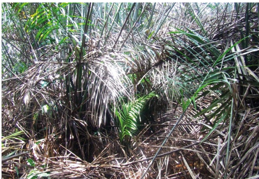
Photo 2. Photo of palm-dominated swamp.