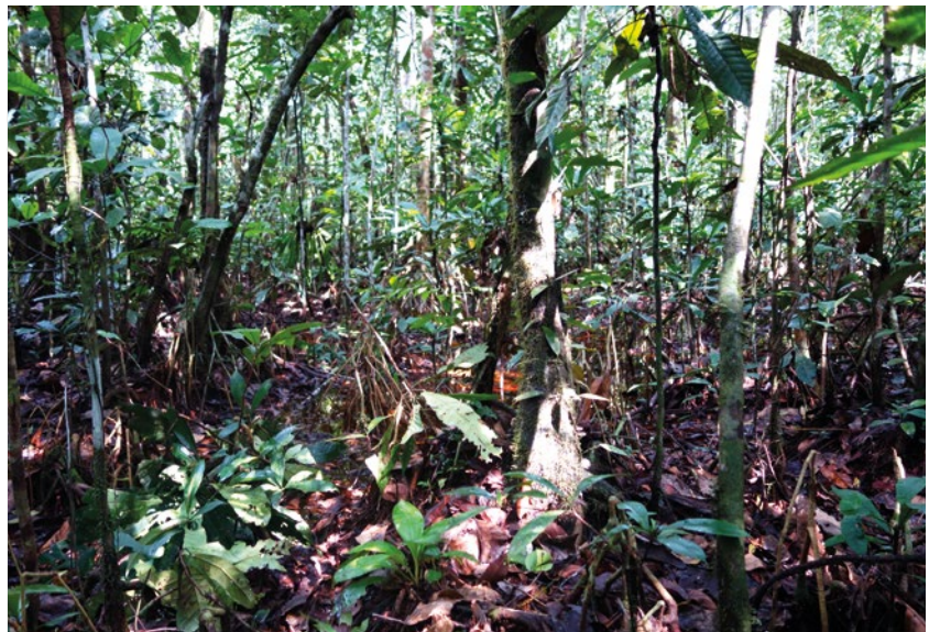
Photo 1. Photo of hardwood peat swamp