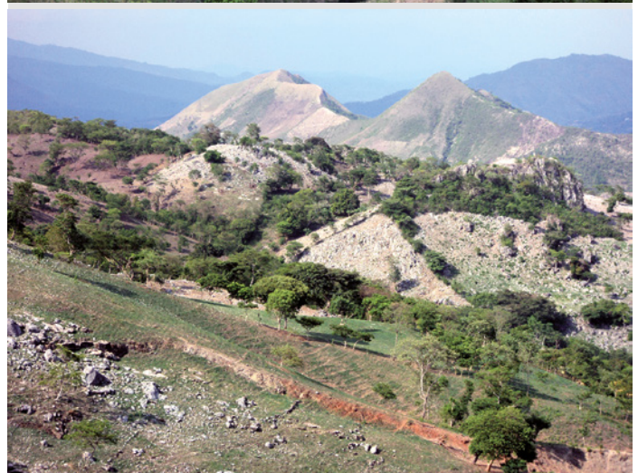
Photos 3. Landscape with conventional cropping system based on maize and bean crops in Camotán and Jocotán.