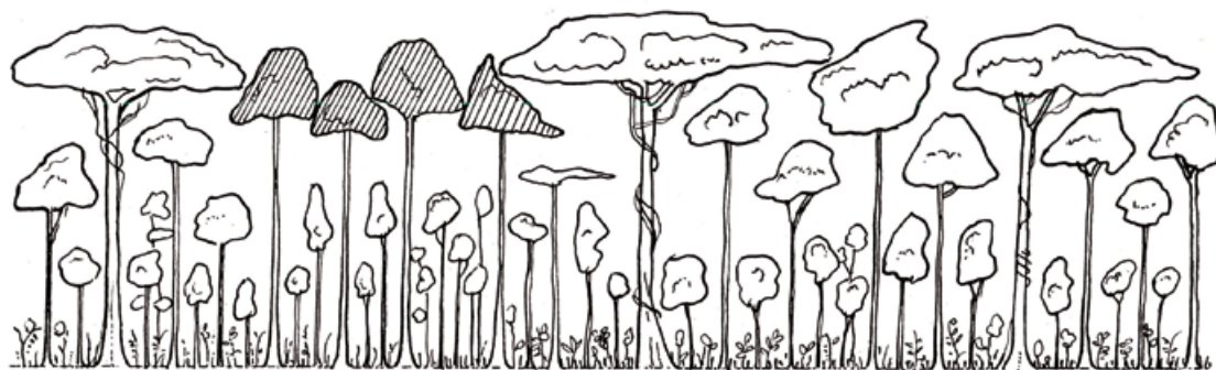
Before improvement work