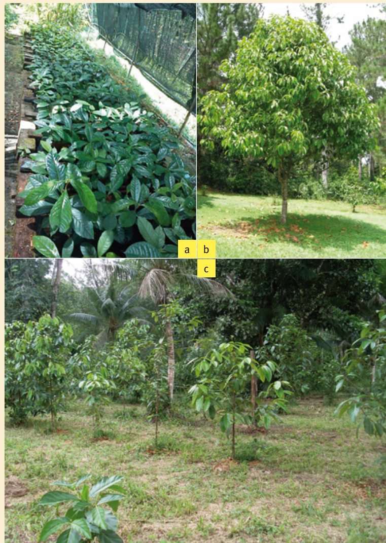
Photo 1. Bois de rose ( Aniba rosaeodora ) : seedling (a), 8 years old tree (b), 2 years old plantation(c).

2 Office National des Forêts (ONF) Département R&D Pôle de Cayenne Réserve de Montabo BP 87002 97307 Cayenne Cedex French Guiana France