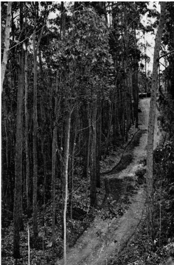
Photo 2. A plantation of eucalyptus...

A few years ago in Madagascar, in the forest of Analazaotra (Périnet), I had an opportunity to admire some magnificent experimental parcels planted, if memory serves,