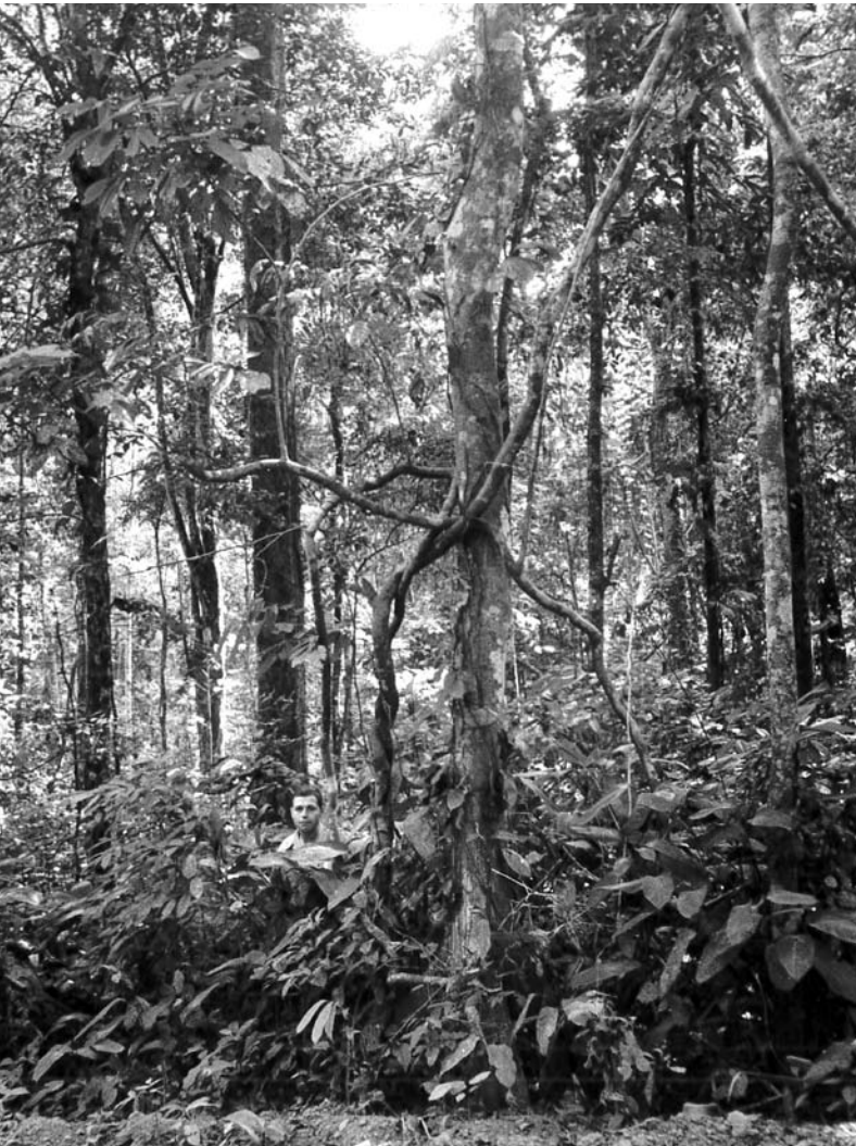
Photo 6. Enrichment planting in what is now the Republic of Congo.