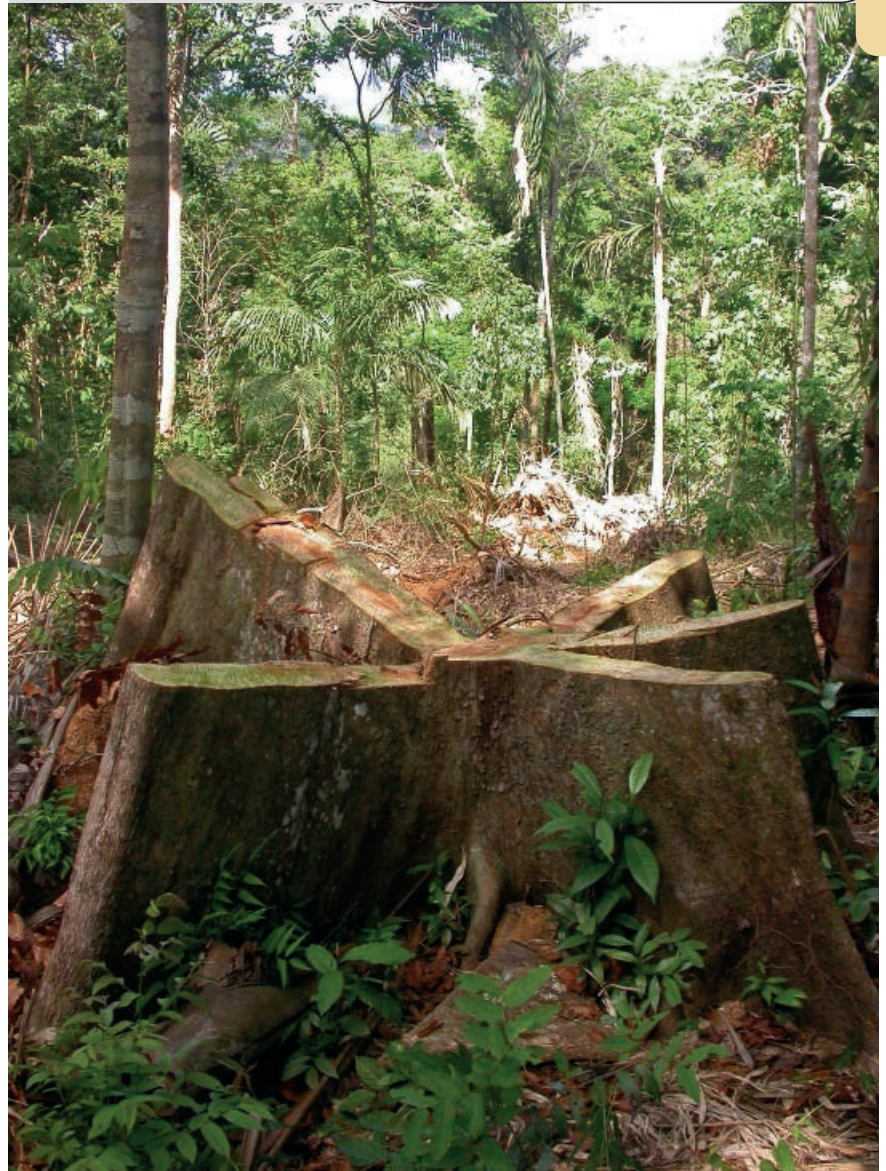
Within the remaining forest logging is done to produce wood for construction and wood charcoal.

The final target of such analysis remains to offer the opportunity to better understand the individual trajectory and logic of migrants and their related use of the land. It is