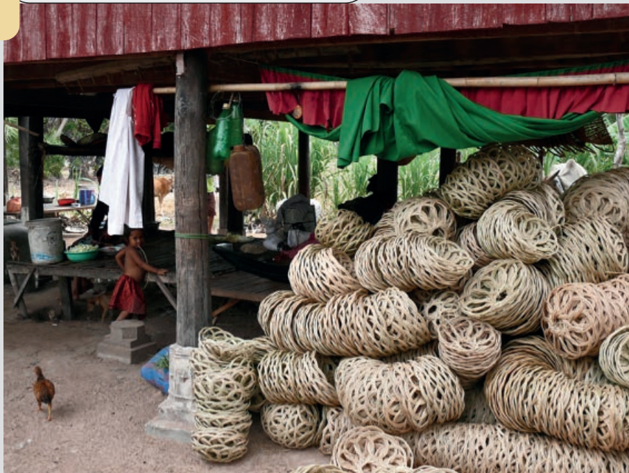
Photograph 8. Rattan baskets used as support for water jars in Kampong Chhnang, Cambodia.