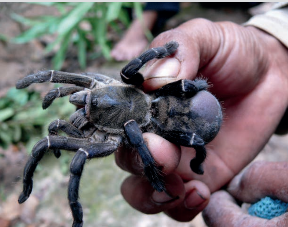
Photograph 9. Spiders are collected in Kampong Thom (Cambodia) to be sold for food.