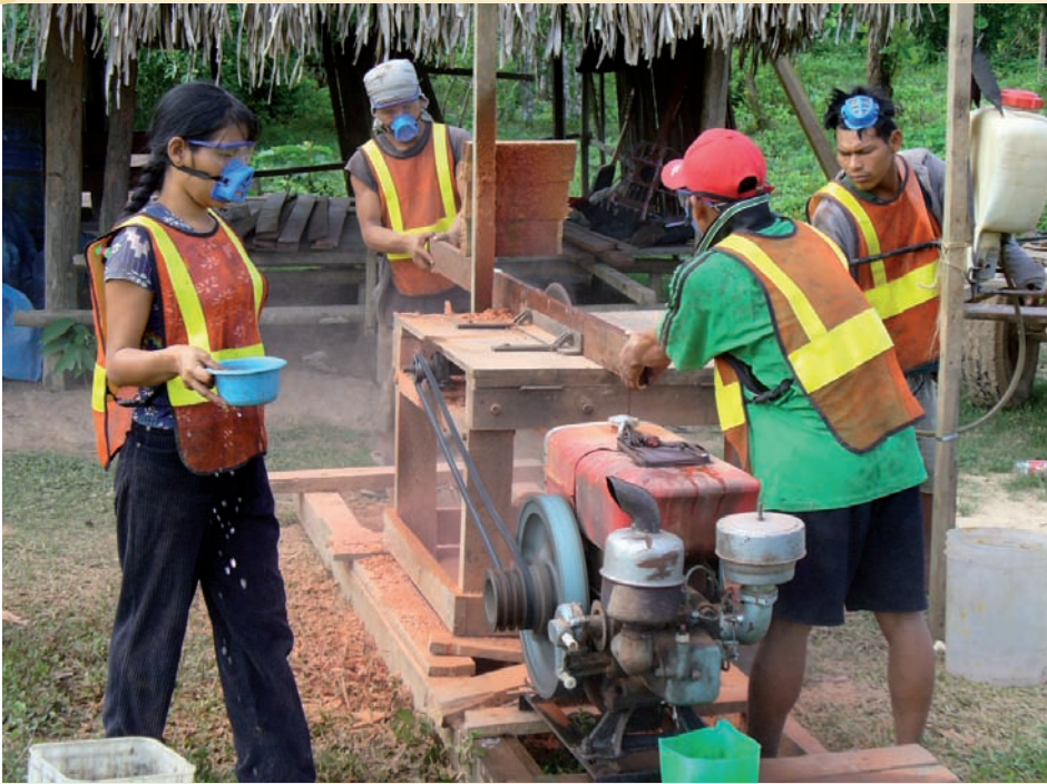
Involving indigenous groups in community forestry is an enormous cultural challenge. This Shipibo-Conibo forest management group process boards with a portable sawmill. They managed to receive FSC certification (see table 1). Community Preferira, Department of Ucayali, Peru.