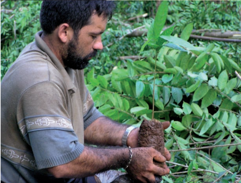
Tree growing is part of many innovative production systems promoted by development agencies. A farmer participating in the project “Roça sem queimar” (Agriculture without burning) is planting a cocoa seedling in an experimental plot. Medicilândia, Transamazonian highway, Brazil.

few possibilities for real participation due to the complexity of their design and, even more so, the methods and procedures of analysis. Communal forestry can only succeed if local capabilities and information requirements can be met through capacity building and simplification of procedures.