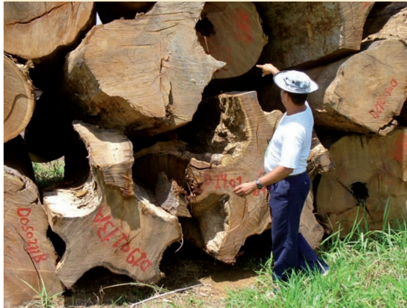
Timber for local development? A community leader checks logs harvested from family owned forests. A State driven cooperative to support commercial management of community forests organizes transport, processing and marketing of the logs. Extractive settlement project (Projeto de Assentamento Agroextrativista) Cachoeira, Xapuri, Acre.

In tropical frontier regions, local families and communities generally compete for land and forests with cattle ranchers, agro-industries, energy and mineral companies and conservation NGOs. Favored by neo-liberal economic policies, the poor performance of the state in rural areas allows these powerful actors to accumulate resources. Typically, frontier dynamics imply extensive land use changes, causing environmental degradation and rural migration. The resulting deforestation is likely to endanger the livelihoods of 15 % of the world's population (MERY et al. , 2005). In these settings, local families usually practice traditional slash-and-burn agriculture, but are gradually shifting to agricultural crops that can be integrated into a regional market economy.