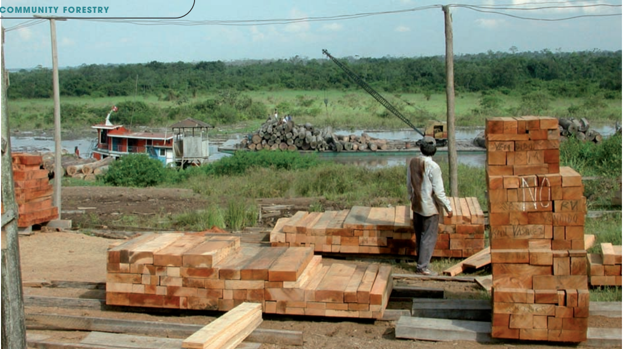
Timber economy in frontier areas. A sawmill worker observes a boat delivering logs harvested from communities along the river Ucayali. City of Pucallpa, Peru.