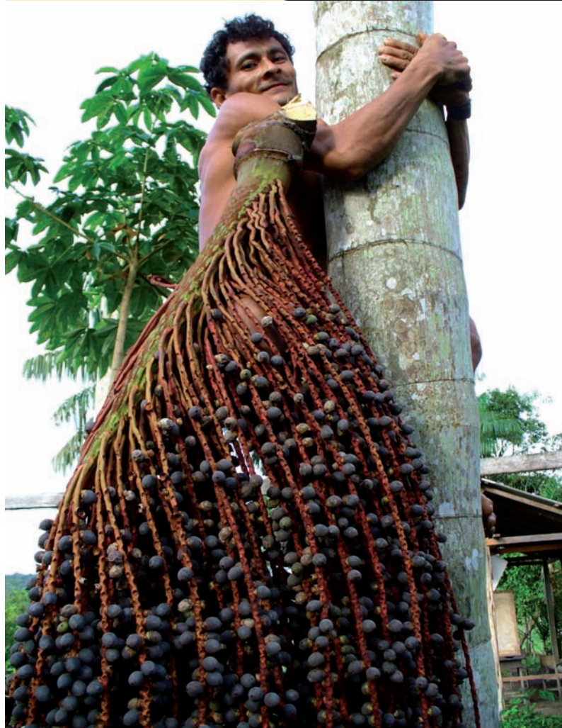
Non-timber forest products often contribute to the livelihoods of traditional communities. A ribereño (traditional communities living by a river) is harvesting fruits of an asaí palm for auto-consumption ( Euterpe oleracea). Community Santa Luzia, Porto de Moz, Pará, Brazil.