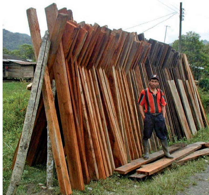
Many families in the region process timber from their forests with chainsaws. The use of guide rail for chainsaw (marco-guia) could significantly enhance efficiency. This farmer in Ecuador is storing boards from his own small forest area. Province Morona Santiago, Ecuador.

Regarding land policies , in the 1980s social movements had already secured the beginnings of formal acknowledgement of traditional ownership rights by many governments in Latin America (Hall, 2000). In the 1990s, countries began granting tenure and access rights over broad forest areas to indigenous groups and traditional communities, such as ejidales in Mexico, community concessions in Guatemala, and indigenous land tenure schemes in Nicaragua and Colombia. In Bolivia, in 1996, the government created the legal status of indigenous territories ( Tierras Comunitarias de Origen ) and implemented legislation for communal properties of up to 500 ha per family (Ruiz, 2005). Brazil earmarked huge forest areas as extractive reserves in combination with several other forms of recognition of local property rights. Peru allocated user rights over equally substantial forest lands to indigenous groups (CHIRIF, GARCÍA HIERRO, 2007). The dramatic increase in formally acknowledged ownership rights of single families and communities over forest lands is one of the reasons for the emerging interest in collaborative natural