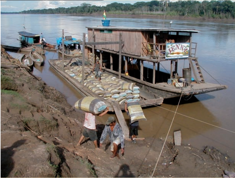
For many families living in remote areas, rivers are the only transport way. Locals are loading a boat with their Brazil nut harvest. River Beni, Pando, Bolivia.

many families with the opportunity to rupture the historically unfair relations to company agents and traders. The many initiatives have also contributed to the formal recognition of traditional land and forest rights. Promoters of FSC certification schemes also highlight positive effects of training, capacity building and closer contact with external players. They point out that communities have learned to deal with the challenges and possibilities of markets and can participate more effectively in public policy-making (HUMPHRIES, KAINER, 2006).