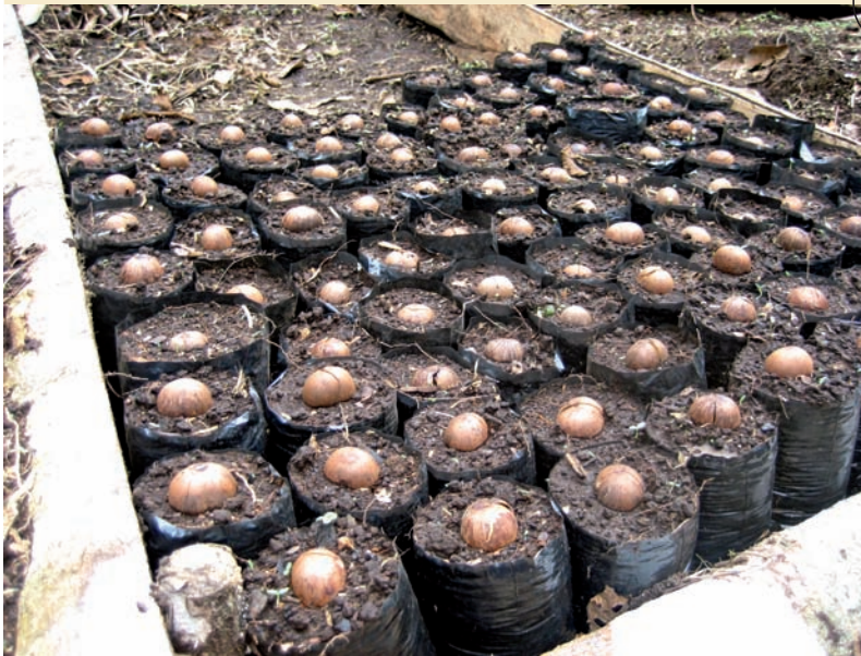
Plantation programs are found all over the region. This nursery of a small local farmer produces Balsa seedlings ( Ochroma sp.). Community El Edén, Province Morona Santiago, Ecuador (Shuar ethnic group).