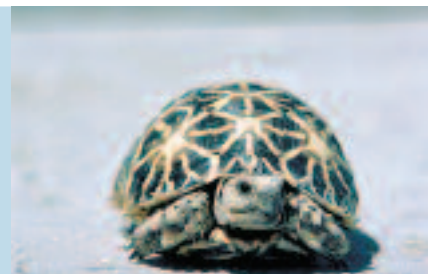
Tortoise. Deception Valley, Kalahari Woodland.