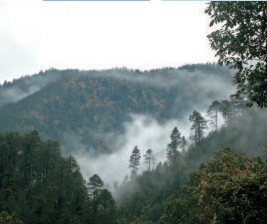
Mountain forest in the Baimaxueshan Reserve. Yunnan, China.