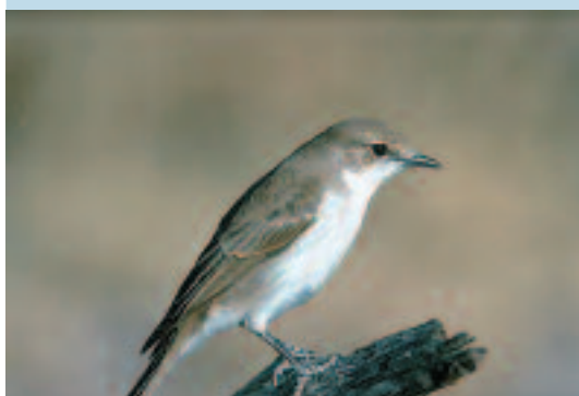
Marico flycatcher in the Kalahari woodland, Botswana. Birdwatching is the most important global ecotourism speciality.