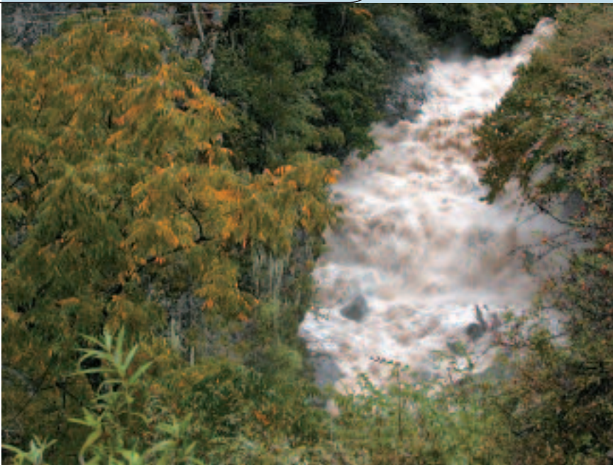
Mountain stream in spate. Yunnan, China.

has heuristic value. His proposal is that to qualify as ecotourism, an activity must possess nine attributes. These are presented below in a slightly modified form.