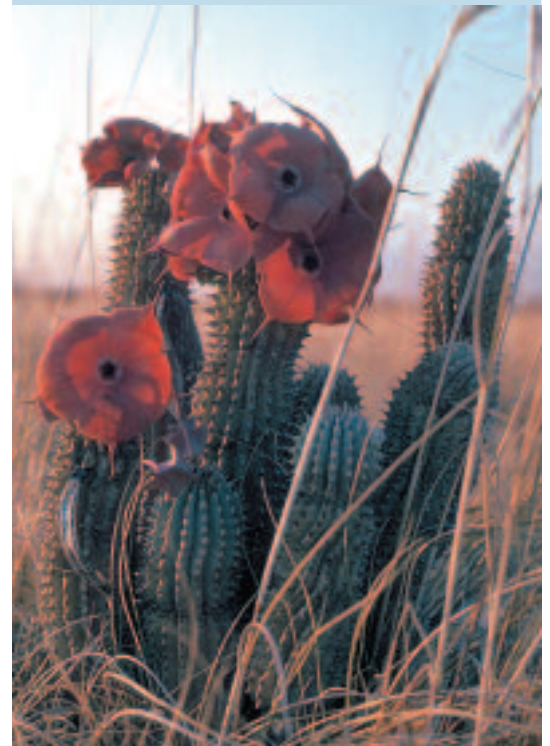
Hoodia. Central Kalahari Game Reserve, Botswana.

▪ Financing mechanisms need to be identified and developed with the