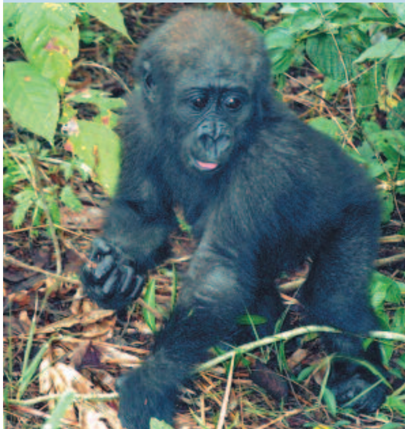
Gorilla infant. Congo Brazzaville.