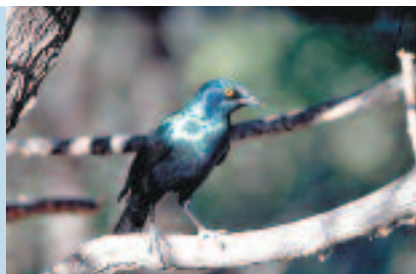
Glossy starling in the Kalahari woodland, Botswana.