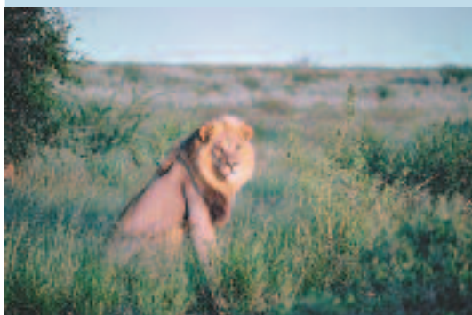
Lion—ecotourism superstar. Kalahari, Botswana.