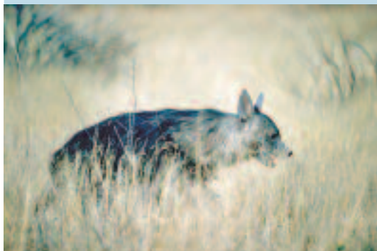
Brown hyen—rare and shy desert specialist. Kalahari, Botswana.