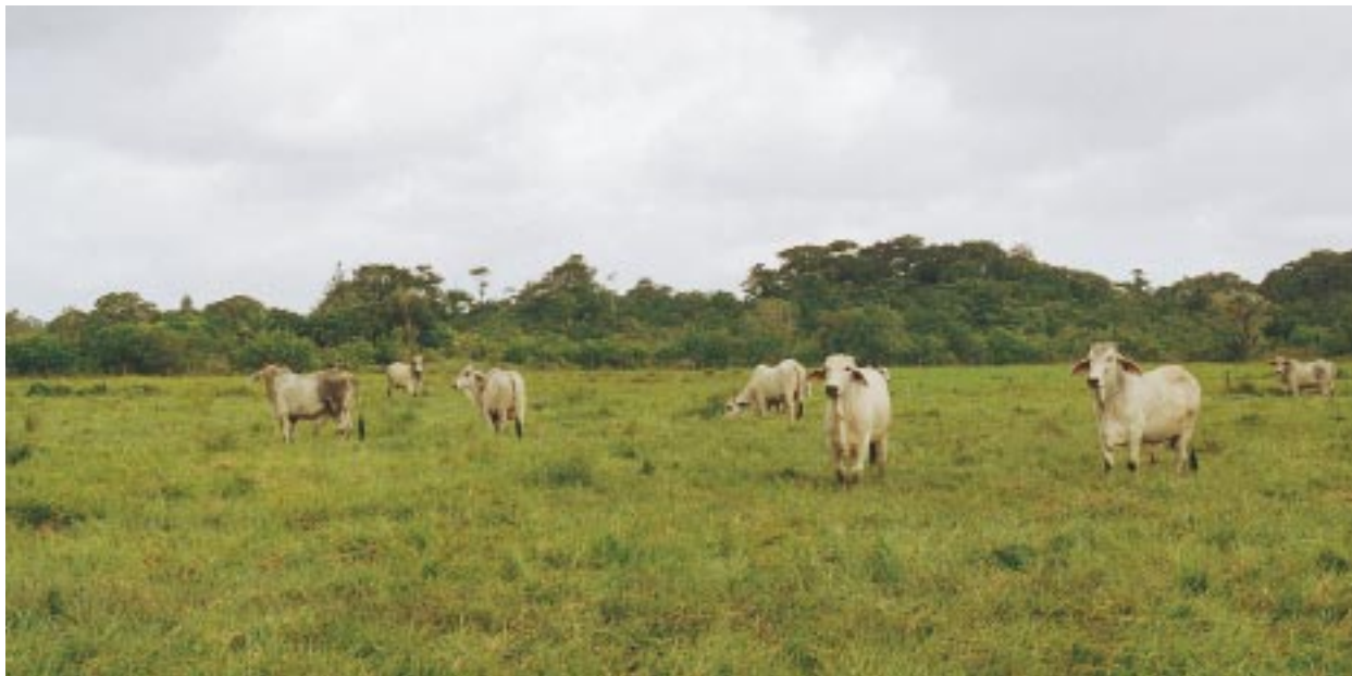
Photo 1. The zebu herd, increasing as it does over a period of time, enhances and maintains land usurped from the forest. It represents the cumulative capital—the fruit of the pioneer's labour. Pará State, Brazil.

Le troupeau de zébus, constitué progressivement, valorise et entretient les terres conquises sur la forêt. Il représente le capital accumulé, fruit du travail du pionnier. État du Pará, Brésil.