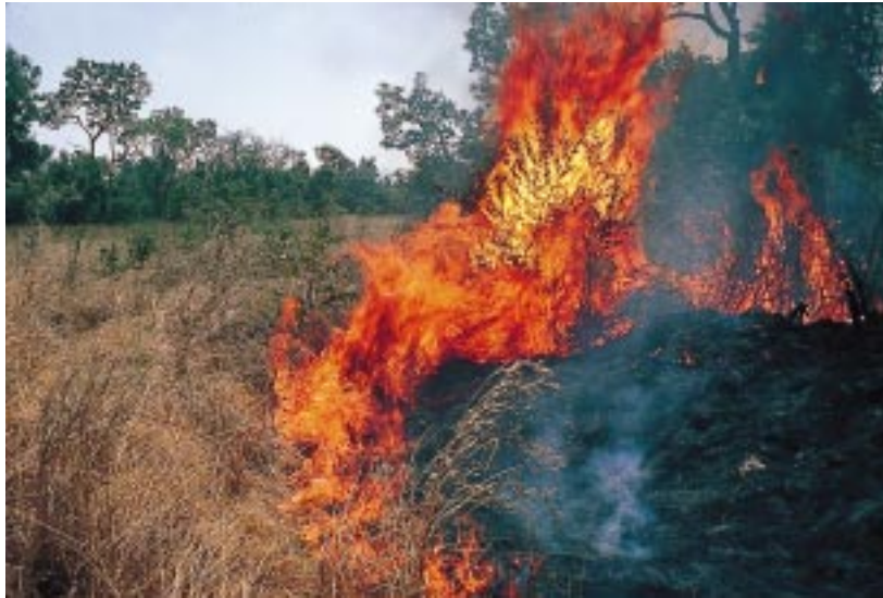
Photo 6. Savannah fires, lit by hunters, livestock rearers and farmers help to maintain an open countryside. Allumés par des chasseurs, des éleveurs ou des agriculteurs, les feux de savane contribuent à maintenir un paysage végétal ouvert.

is increasingly recognized. Community-based wildlife management is becoming generally accepted as an essential component of sustainable wildlife management and in managing livestock-wildlife interactions. Property rights instruments have the potential to grant resource users a tangible interest in the environmental consequences of their actions.