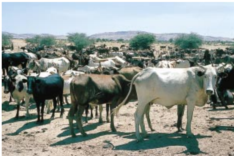
Photo 5. Watering holes, ponds and bore holes are daily gathering places. The surrounding area is heavily trampled and degraded, sometimes over several kilometres. Biltine, Chad. Les points d'eau, mares ou forages, sont des lieux de rassemblement quotidiens. Les alentours sont très piétinés et dégradés, parfois sur plusieurs kilomètres. Biltine, Tchad.

Institutions are required to develop environmental policies, enforce environmental regulations and monitor compliance. For traditional grazing systems, local empowerment is required: the need to transfer authority and responsibility for resource management to the lowest level at which it can be exercised effectively