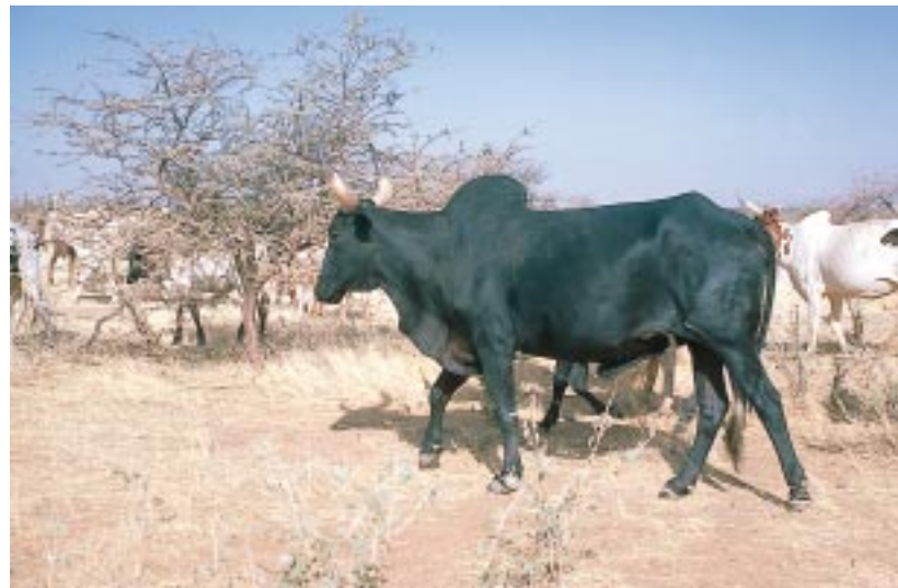
Photo 4. Livestock farming is the most evident activity in the Sahel. Grass and shrubs provide fodder. Oursi, Burkina Faso. L'élevage est l'activité la plus apparente dans le Sahel. Herbes et arbustes fournissent le fourrage. Oursi, Burkina Faso.

of production is growing rapidly in humid and sub-humid tropical zones (STEINFELD et al. , 1998).