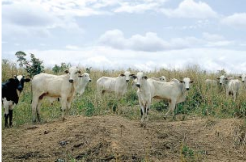
Photo 3. Large estates—fazendas—are involved in livestock farming which pays off as long as the pasture is in good condition. Should the pastures degrade, they are abandoned, and the forest takes over. Paragominas, Pará State, Brazil. Les grandes propriétés, fazendas, maintiennent une activité d'élevage, lucrative tant que le pâturage est en bon état. Dans le cas où ce pâturage viendrait à se dégrader, il serait abandonné et la forêt s'installerait. Paragominas, État du Pará, Brésil.