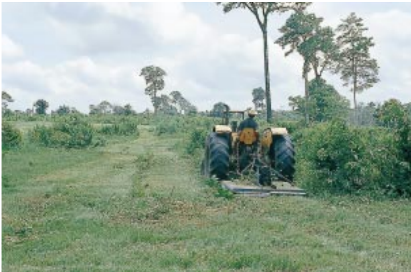
Photo 2. After some years, pasturelands degrade and are invaded by ligneous vegetation. Mechanical equipment is required to restore them to their former state. Farmers then sell this land to large landowners. Paragominas, Pará State, Brazil. Après quelques années, le pâturage se dégrade et il est envahi par des ligneux. Il faut des moyens mécaniques pour le réhabiliter. Les paysans vendent alors ces terres à de grands propriétaires. Paragominas, État du Pará, Brésil.

surfaces are caused by animal trampling, estimated at five to ten percent of the total area.