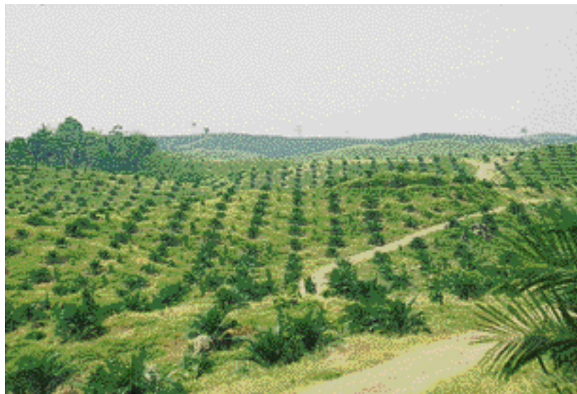
Photo 6. Intercropping teak and oil-palm : a need for long clear bole and narrow crown teak clones. Cultures associées de teck et de palmier à huile. Il convient de disposer de clones de teck caractérisés par de longs fûts et des houppiers étroits.

In addition to these studies on cloning ability with regard to true-to-type development, within-clone variability investigations can be linked to many traits, including those of major economical incidence such as growth rate, trunk form, wood characteristics. Improving within-clone uniformity will reduce "C effects" (TIMMIS et al. , 1987) for more accurate genetic parameter estimates (KAOSA-ARD, 1998), with particular mention for broad sense heritability (AHUJA, LIBBY, 1993).