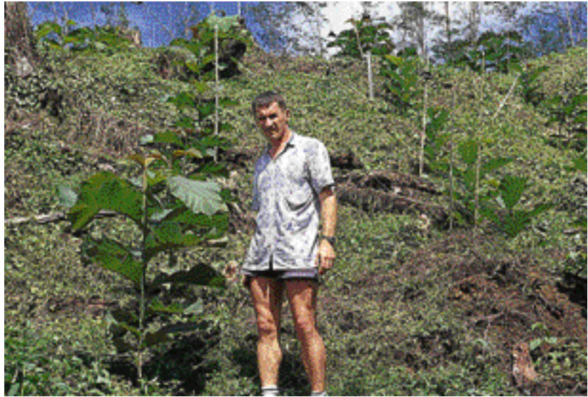
5.2. Mericlone block three months after planting. Bloc de plants mériclonaux trois mois après la plantation.