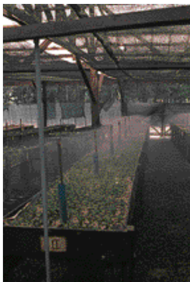
3.1. Mist-system for mass propagation by cuttings in nursery conditions. Bouturage industriel sous brumisation en conditions horticoles.