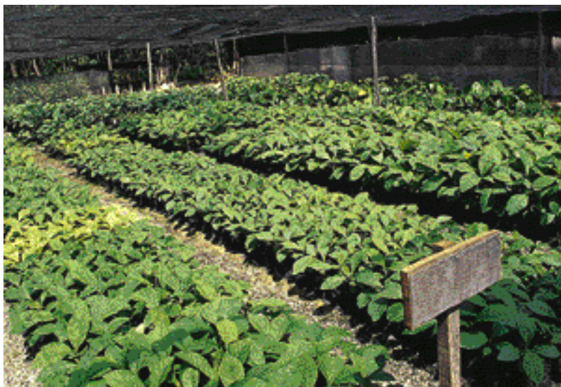
Photo 4. Intensive cultivation of clones produced either by cuttings or microcuttings before planting. Culture intensive de plants clonés, par bouturage ou par microbouturage, avant la plantation.