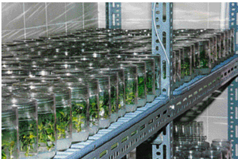
3.2. In vitro micropropagation by microcuttings. Micropropagation in vitro par microboutures.