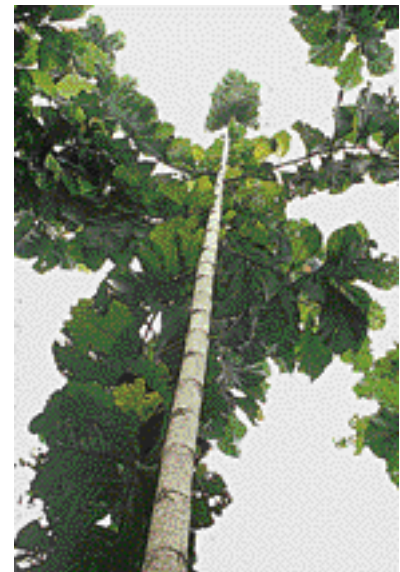
5.3 and 5.4. Mericlone plants 18 months after planting. Plants mériclonaux un an et demi après la plantation.

Photos 5. Production of “mericlones”, each derived from a single shoot apical meristem of 0.2 mm in size introduced into tissue culture conditions. Production de « mériclones » chacun provenant de la culture in vitro d'un méristème apical de 0,2 mm.