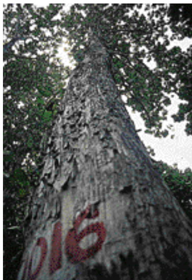
Photo 2. Candidate Plus Tree (CPT) for cloning. Arbre « Plus », tête de clone potentielle.