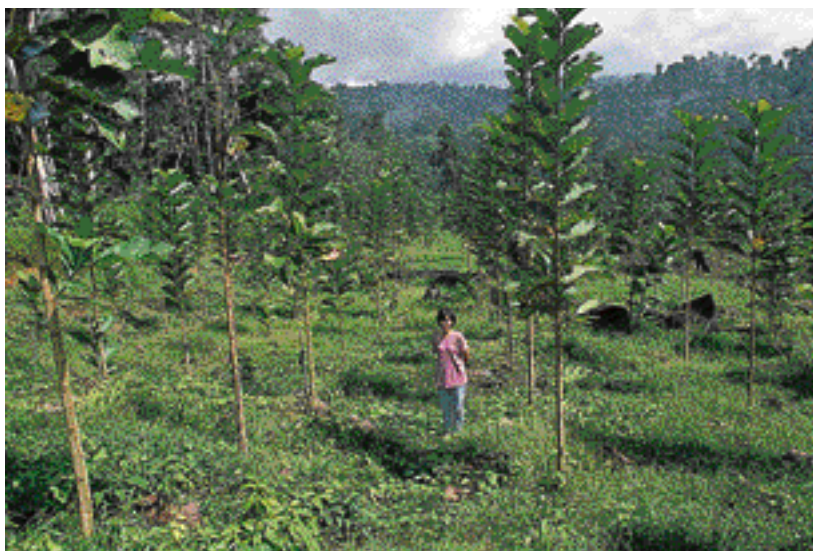
Photo 1. One year-old monoclonal teak plot in Sabah (East Malaysia, north of Borneo). Parcelle monoclonale de teck de un an au Sabah (Malaisie orientale, nord de Bornéo).

The venue of the last Teaknet meeting held in 1999 in Chiang Mai (Thailand) offered an opportunity to review the possible limiting factors responsible for this situation. Lack of planting stock, especially of superior quality, was unanimously identified as the primary cause of this deficit in teak timber, highlighting the limits of conventional ways of propagating teak by seeds, and consequently the urgent need to consider other alternatives for increasing the productivity of teak plantations. In this respect, vegetative propagation techniques, especially the clonal option (photo 1), merit special attention in view, on one hand, of the resulting advantages obtained for many species (ZOBEL, TALBERT, 1984 ; AHUJA, LIBBY, 1993), and, on the other hand, of the latest advances in vegetative propagation techniques for teak (GAVINLERTVATANA, 1998 ; GOH, 1999 ; MONTEUUIS, 1999 ; WHITE, GAVINLERTVATANA, 1999).