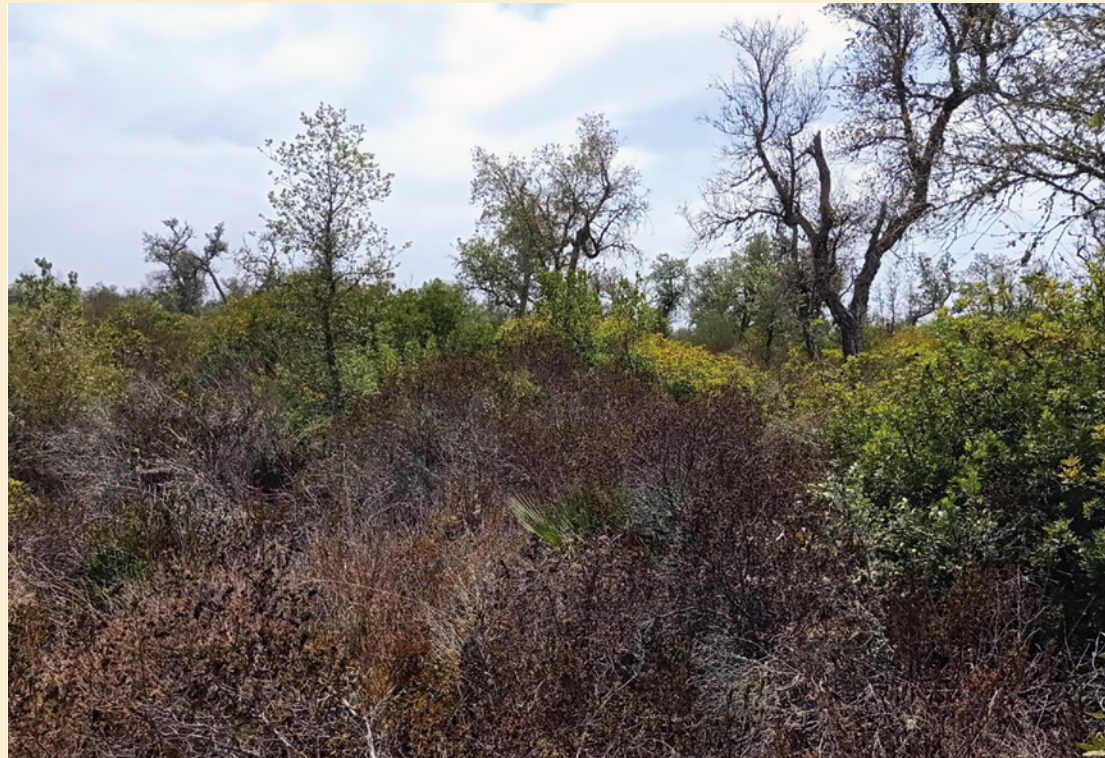
Photo 1. Undergrowth after a fire in the Western Rif, Morocco.

Auteur correspondant / Corresponding author: Salaheddine ESSAGHI – s.essaghi@gmail.com