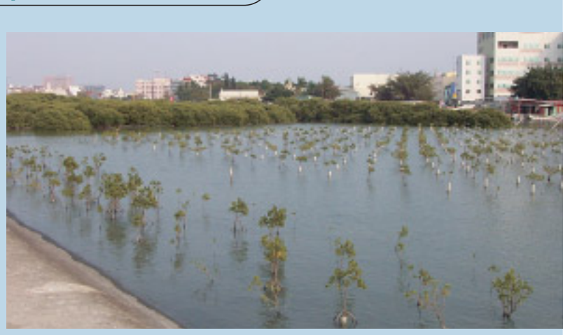
Photo 7. A magnificent view of Rhizophora stylosa and Lummitzera racemosa seedlings in the flooded area. November 2001.

52 BOIS ET FORÊTS DES TROPIQUES, 2002, N° 273 (3) DOSSIER MANGROVES / TAIWAN