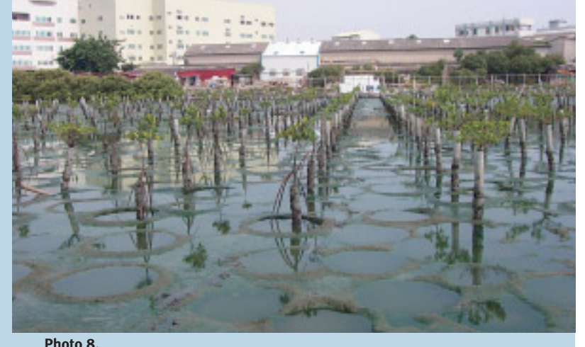
The deepwater area at low tide for numerous fish habitats. August 2001.

in a variety of coastal environments, approaching the biomass, stand structure, and productivity of natural forests within two decades. Unfortunately, some conservation organizations in Taiwan have convinced the public that mangrove seedlings seldom survive and that a mangrove forest is difficult to establish.